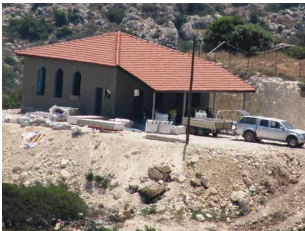
Elmatan synagogue on June 2, 2009, two days after an interim order was issued forbidding construction of the building.

At the first hearing on the petition on June 7, 2010, the State informed the High Court that the interim order forbidding construction had indeed been violated and that it had therefore decided to seal and fence off the building.