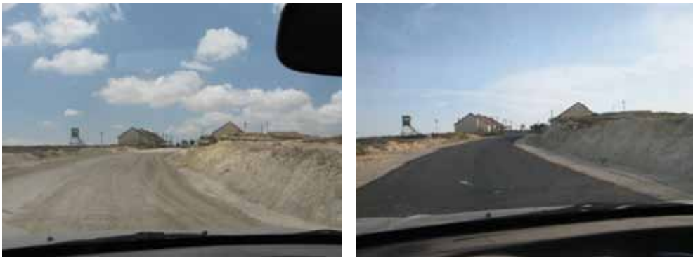
Construction of the road between Eli and the Hayovel outpost continues after issuing the interim order. Left: the road in early 2009. Right: the paved road after the interim order was issued, October 25, 2009.