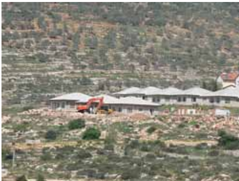
Construction work at Rehelim on March 22, 2011 in violation of the interim order given two years earlier.

During a hearing on the petition it emerged that apparently in the 10 days that passed between submitting the petition and issuing the interim order, three of the buildings that were the subject of the petition had been inhabited in an opportunistic grab, whose purpose appeared to be establishing facts on the ground and obstructing the demolition of the illegal buildings.