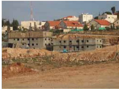
Construction work on Qasem's land despite stop work and demolition orders issued for the buildings. Right: The construction work on January 23, 2011 (a day before the interim order was issued); Left: the construction work on March 6, 2011.