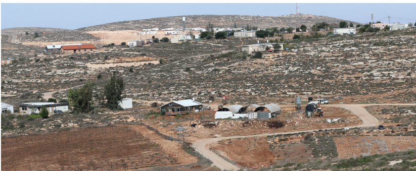
The unauthorized outpost of Adei Ad, 18 November, 2018

The state is expected to declare the establishment of some 20 new Israeli settlements in the West Bank as part of the 'regularization' policy and the implementation of the report. These are unauthorized outposts that cannot be 'regularized' as neighborhoods in approved settlements and which the state was unable to find any other way to retroactively authorize.