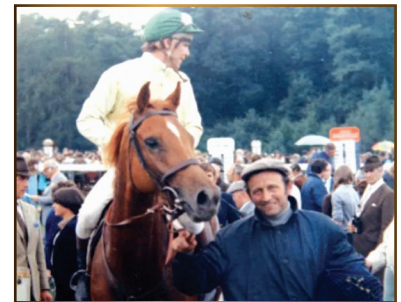
Gay Future, 1974: Double (and Treble) Jeopardy.