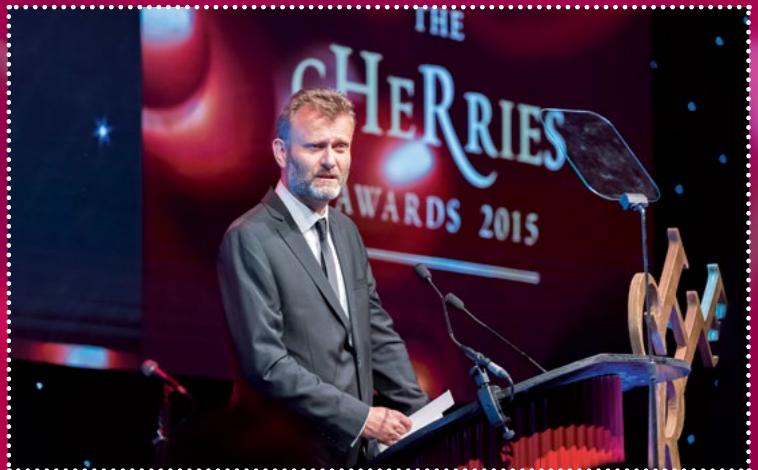
Hugh Dennis hosted the evening event