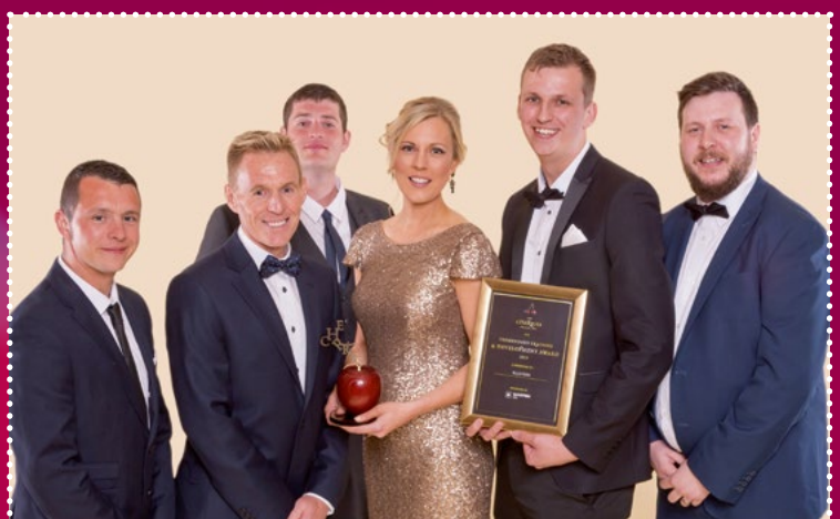
Baxters Food Group Team