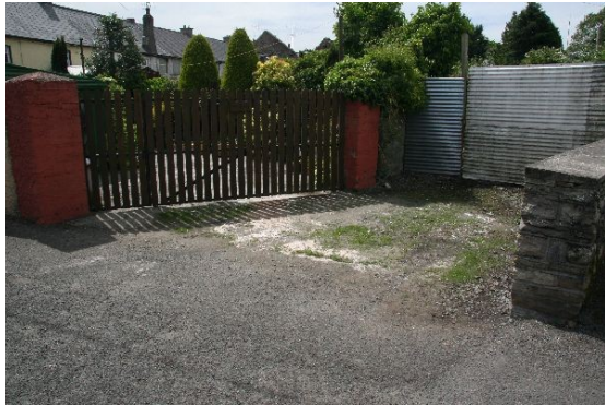
Figure 3: Rear of houses on Patrick Street.