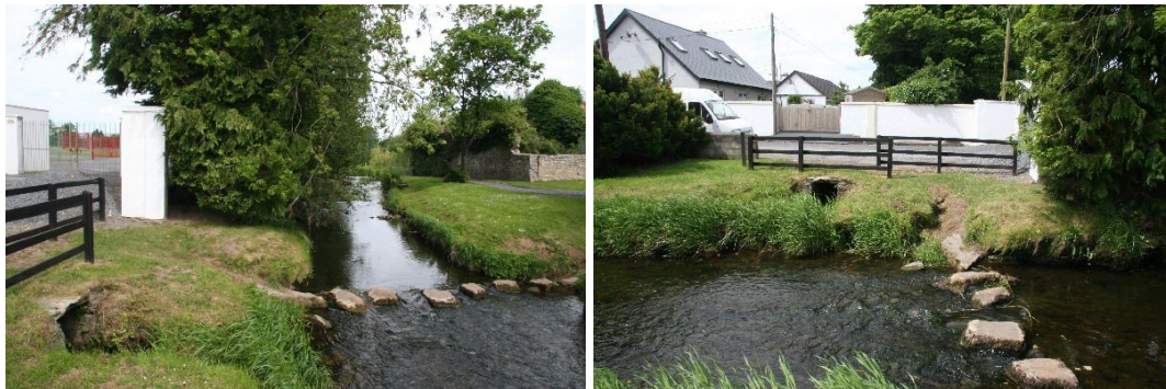
Figure 2: Possible entry points for flood water. The stream enters the river in the stone culvert.

Water level information provided by Laois County Council does not show any major changes in water level, and it appears that the river flowed at or just above bank full. The area where the flood occurred is low lying. There are two possible entry points for flood water to the area, at a fenced section of bank beside some stepping stones, and along the river bank through the GAA grounds. There is also a small stream that enters the Whitehorse River at this point from the west.