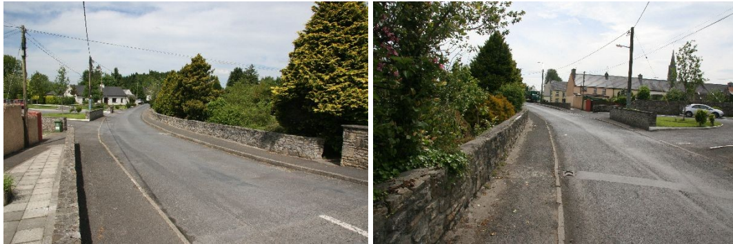
Figure 1: The area that flooded. The river is behind the stone wall.

The flooding that occurred on 31 st March appears to have been localised to an area on the right bank of the Whitehorse River and between Patrick Street and the GAA grounds.