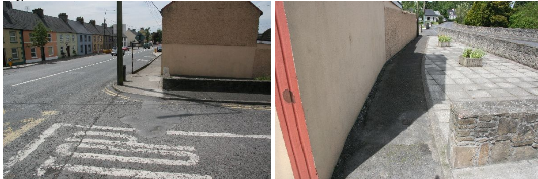
Figure 4: View along Patrick Street and of paved area beside houses.

A sewerage pipe crosses underneath the N8 road bridge on a steel beam. This could form a control for flood water.