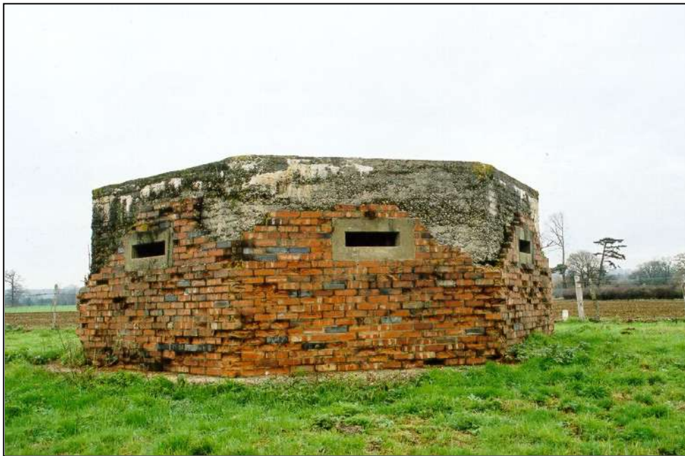
Fig. 5 - UORN 2476: type 24 infantry pillbox with large sections of brick shuttering apparently deliberately removed.

Further to the south are more infantry pillboxes, one [UORN 2469] positioned within the loop of a side stream from the river. Close by, the banks of the Mole were evidently not considered sufficiently steep or high to serve as an effective anti-tank barrier for they were reinforced by over thirty pyramidal-topped concrete cubes on both sides of the river [UORN 2455]. These form a remarkable survival in a remote location and show what the cubes at Sidlow Bridge, removed in the 1950s, would have looked like. The river banks may also have been cut vertically and revetted in places, although there is no surviving evidence of this.