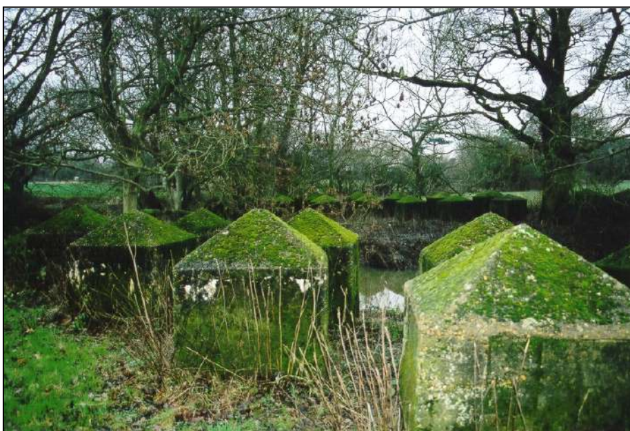
Fig. 8 - UORN 2455: anti-tank cubes strengthening the banks of the River Mole as an obstacle to enemy armoured vehicles.