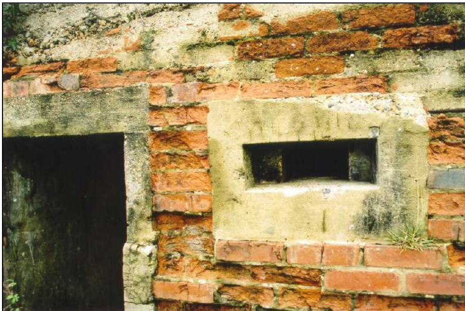
Fig. 7 - UORN 2477: an embrasure of a reinforced concrete, brick-shuttered pillbox.