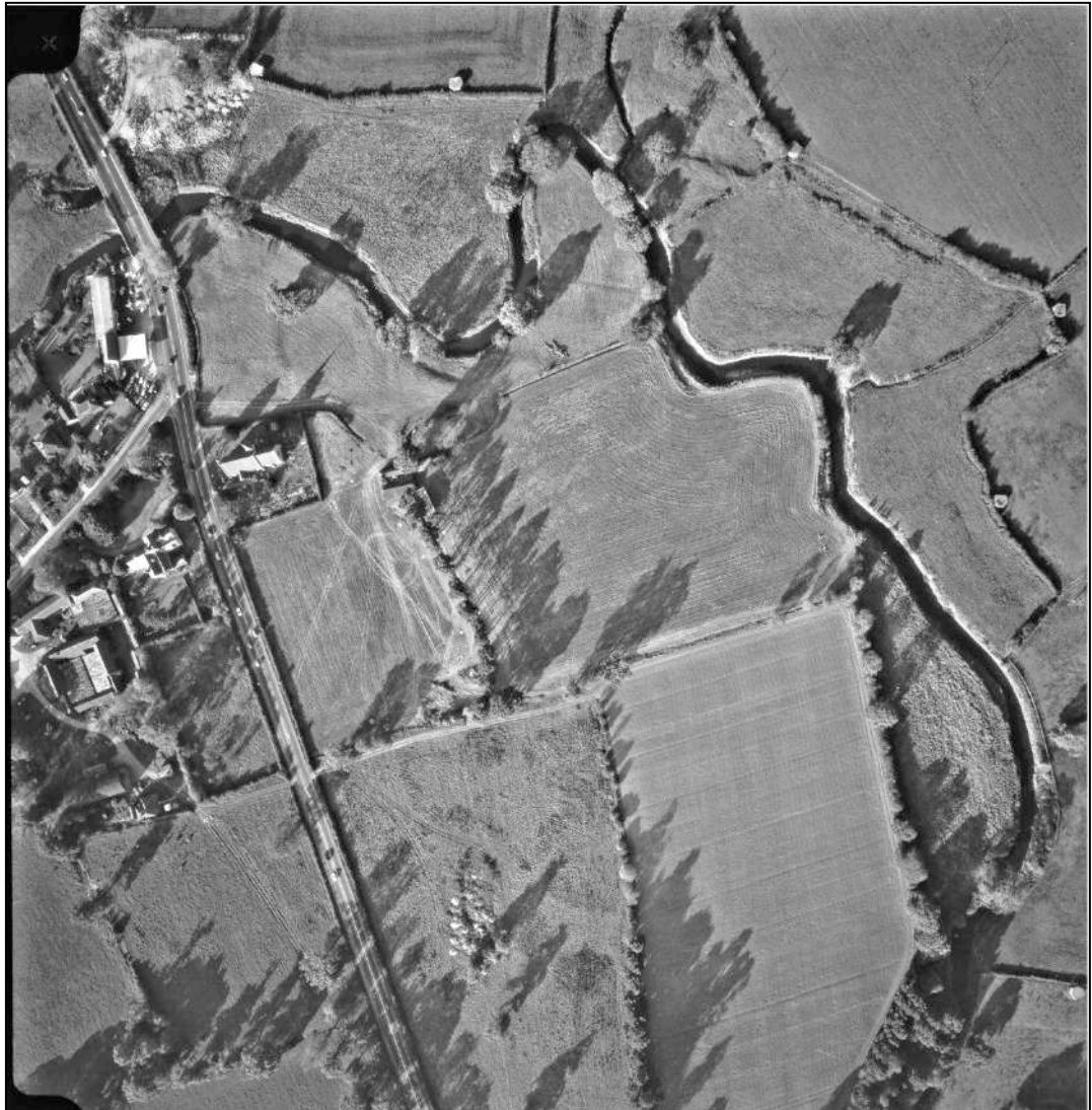
Fig. 3 - Aerial photograph taken in 1969 showing Sidlow Bridge [upper left] and pillboxes following the course of the river towards the south-east.

the study area and lie on private land to which access without permission is impossible].