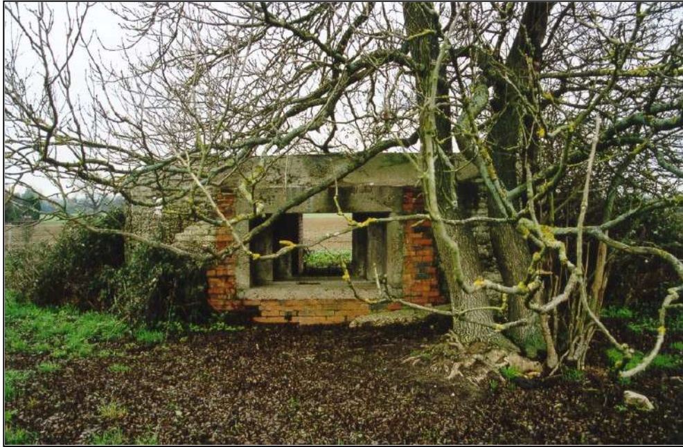
Fig. 4 - UORN 2458: anti-tank gun emplacement mounting a 6pdr. gun firing towards Sidlow Bridge.

of a wood, and with no public access, is a damaged all-brick pillbox with pre-cast embrasure surrounds [UORN 2467].