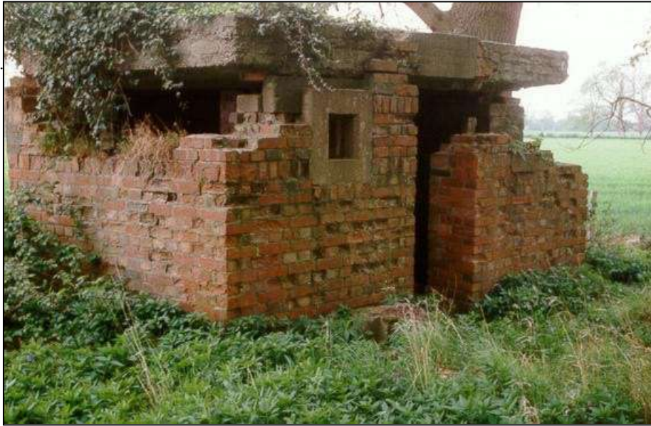
Fig. 6 - UORN 2467: an all-brick pillbox with pre-cast embrasure surrounds, in very bad condition.