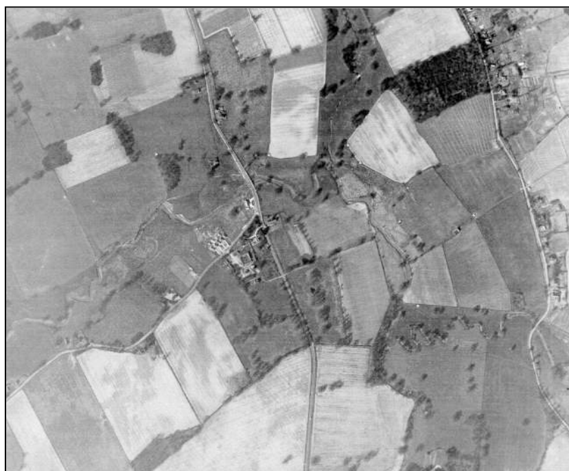
Fig. 1 - 1947 aerial photograph showing Sidlow Bridge at the centre, with the River Mole winding a course from the west to the south-east.

The defence area is bordered to the north of Sidlow Bridge by an arbitrary line drawn across the flat landscape, to the west by the settlement of Sidlow, and to the east and south by the course of the river and by White Owl Farm and Kinnersley Manor. The focus of the area is Sidlow Bridge and the pillboxes lying to the east of the bridge, with a viewshed set within the curving river plain and marked to the north by a tall pillbox [UORN 2481].