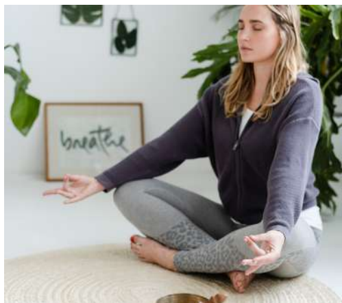
Both sessions available as in-person classes. Up to 100 people online.

with graceful movements accompanied by deep circular breathing. It reduces stress whilst improving flexibility and balance, and strengthens the immune system. During a glo Tai Chi class, the group will be guided through simple exercises and movements and then allowed time to practise. Classes are suited to people of all ages and are conducted in a quiet environment, enabling participants to find their own natural rhythm and a deeper awareness of their body in movement.