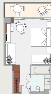
FAMILY ROOM Double bed + 2 sofa beds 32m 2