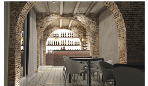
COSALTRO ITALIAN RESTAURANT