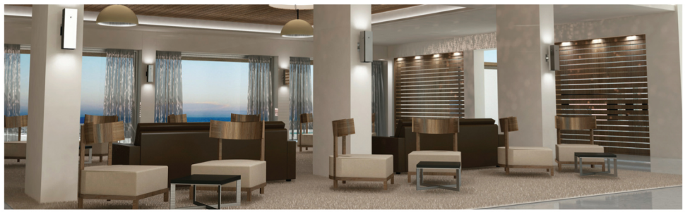
NEW MODERN COMFORTABLE LOBBY