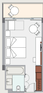
SUPERIOR ROOM Twin or double bed 26m 2