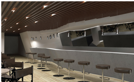
APHRODITE LOBBY BAR