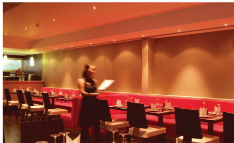
AKAKIKO JAPANESE RESTAURANT