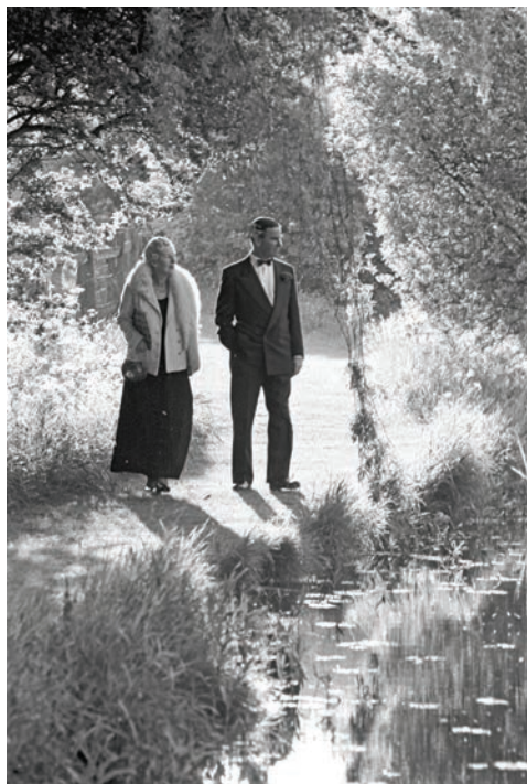
Down by the lake, 1965

The return of the David Hockney-designed The Rake's Progress will mark the 45th anniversary since the production debuted at Glyndebourne in 1975. Stravinsky's 1951 opera follows the decline and fall of Tom Rakewell who leaves his true love Anne for the bright lights of London under the guidance of Nick Shadow – the devil himself. He marries the exotic and glamorous Baba the Turk, who we first meet after her black sedan chair arrives outside Tom's house. Baba's style does not stop with her decadent modes of travel. Hockney's costume for Baba is one of the more colourful designs in a production that relies solely on blues, reds, greens and blacks; the only ink colours that were available to printing presses at the time of Hogarth's