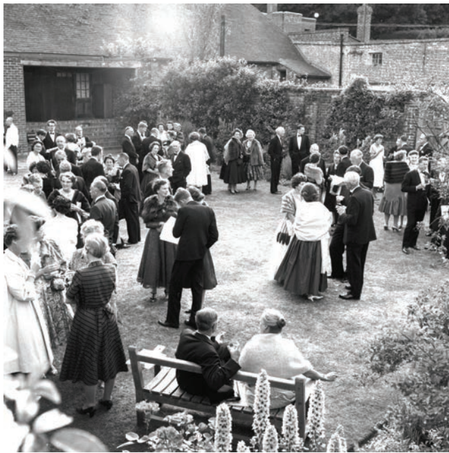
Audience in the gardens, 1959

around the gardens. Even the picnic baskets are a tour de force of style. But as the bell rings for visitors to drink the last of their champagne and to take their seats, glamour at Glyndebourne is not momentarily extinguished when the house lights go down. When the curtain goes up it's the Cleopatras, the Alcinas and the Escamillos that take over. Glamour personified. Festival 2020 will see the return of one of the most glamorous characters in opera to the Glyndebourne stage – Baba the Turk.