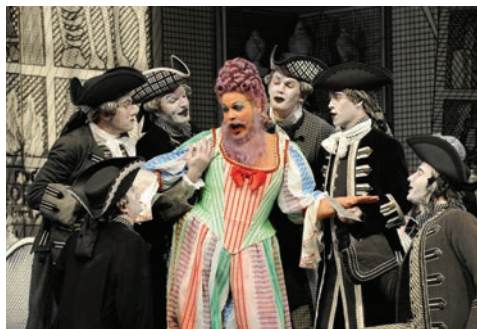
Baba the Turk in The Rake's Progress

Now, you might think – this is not glamorous at all! Think more Lady Gaga than Mrs Slocombe. But, look again. Have you ever seen someone more glamorous and stylish? As Nick Shadow tells Tom, 'they say brave warriors who never flinched at the sound of musketry have swooned after a mere glimpse of her'. High praise indeed. Style and glamour are rooted in confidence, something that Baba has in scores. Baba is the only character that Hockney allows to wear purple and one of the few characters who remains unaffected with the onset of black and the loss of colour later in the performance. And so, as Baba the Turk reminds us, in her full-colour splendour, standing out from everyone else when all colour has faded – you can never be too overdressed at Glyndebourne!