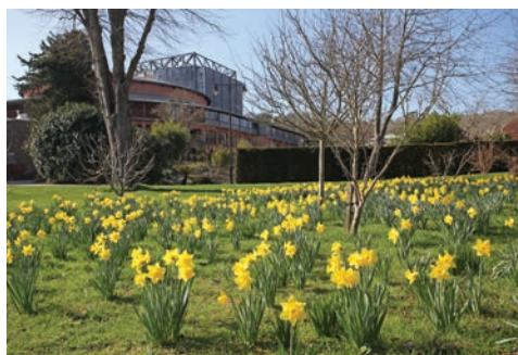
Narcissus in March

It's also time to move the bulbs that you enjoyed in the house through Christmas and the new year outside. We plant up Narcissus 'Tête-à-Tête' in pots ready for Christmas and January flowering indoors, but by February they can be moved outdoors to a frost-free place to die down, and later the bulbs can be