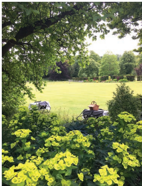
Euphorbia near to the Mulberry tree

At Glyndebourne it's time to check the tree ferns, Dicksonia antarctica , in the Bourne Garden. For winter protection the old fronds have been crumpled up and tucked into the crown at the top of the trunk, as it's water getting into that space and freezing which can finish off a tree fern. In February and March