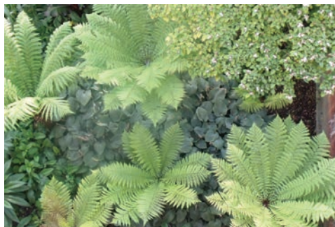
Tree ferns, Dicksonia antarctica

planted out in a sunny spot. You can do the same with indoor potted hyacinths.