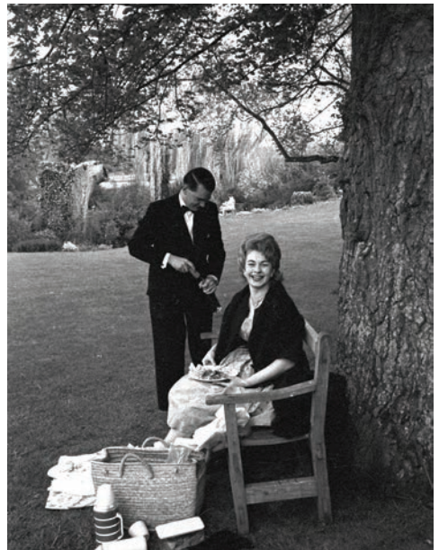
Festival first night, 1962

Style and glamour at Glyndebourne are impossible to miss whilst picnicking