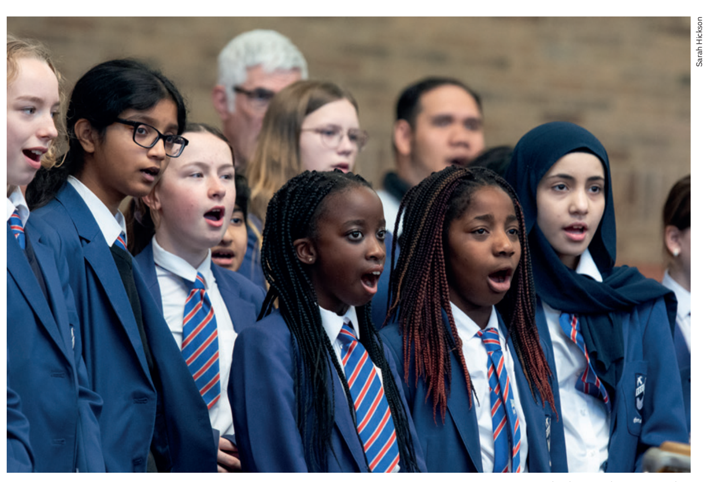
Singing Schools Network project (Crawley)

'I need to say a massive thank you for everything you've done for us this year. Every single minute of this project has been a huge inspiration for our students and you've created an event that they'll never forget. I thought yesterday was absolutely extraordinary and I'm unbelievably proud of our students. It was such a pleasure to have been involved in this project, thank you so much for working with us'