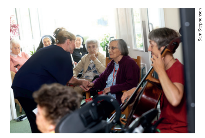
Good Company project

We worked with St Clare's and St Rita's care homes in Ditchling, Lime Tree House and Parris Lawn care homes in Ringmer, Lydfords Care Home in East Hoathly, Holy Care Cross Home in Heathfield and two groups from the Raise Your Voice charity.