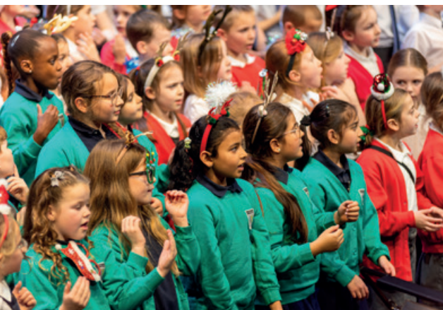
One Voice Festival of Singing (Glyndebourne)