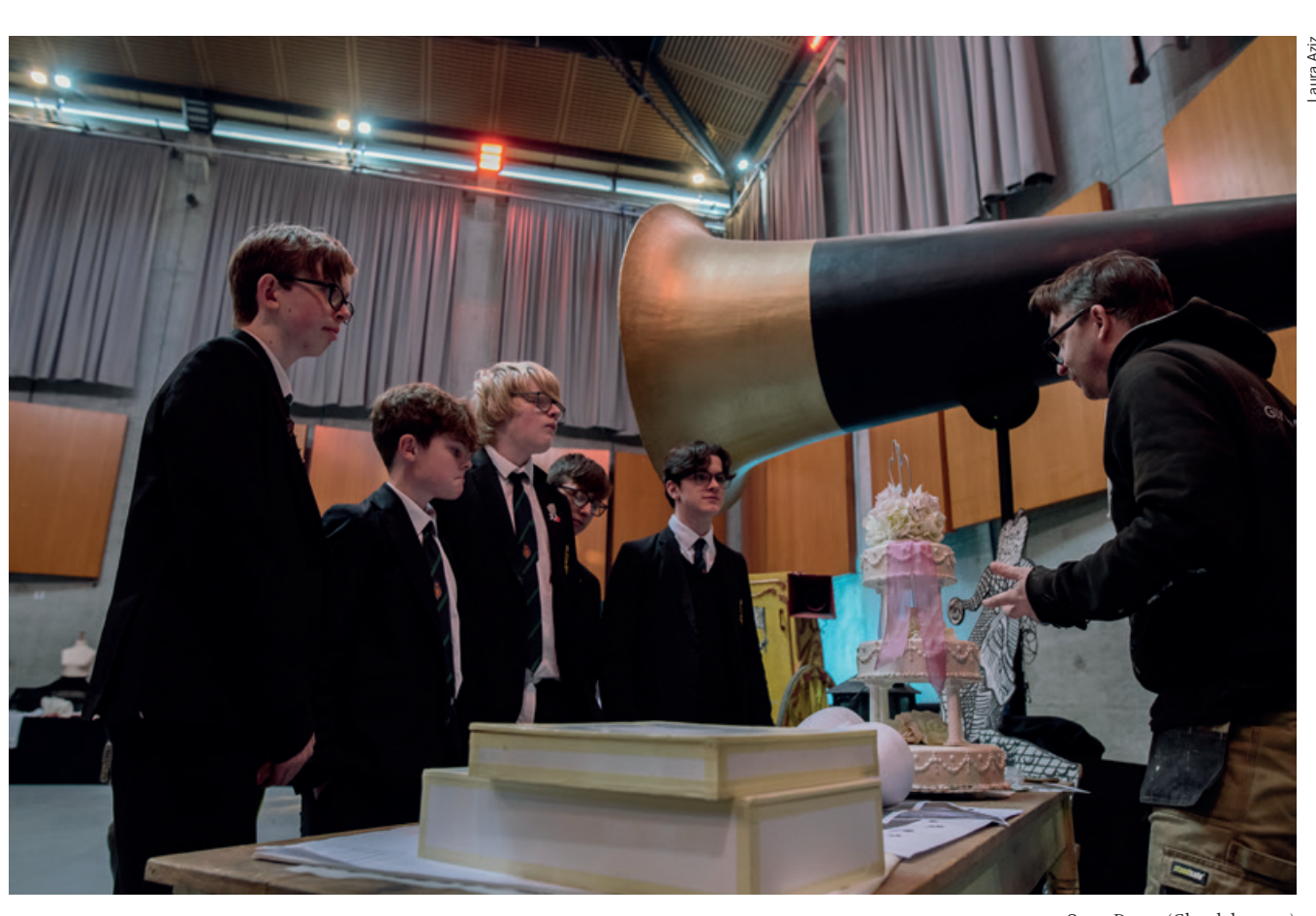
Open Doors (Glyndebourne)

Once again, we worked with pupils and schools from lower socio-economic backgrounds, based on Pupil Premium and Free School Meal rates. Nearly 200 young people attended, from mainstream, SEND (special educational needs and disabilities) and SEMH (social, emotional and mental health) schools, virtual school for children in care, home educators and Steps for Success (an ESCC group that supports students with low school attendance).