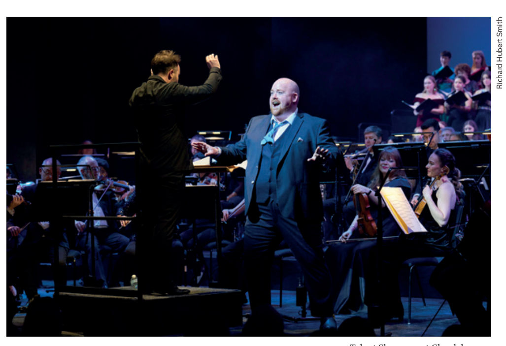
Talent Showcase at Glyndebourne

We will continue to work with primary and secondary schools across Brighton & Hove, Crawley, Eastbourne and other parts of East Sussex through a programme of singing in state schools which culminates in the thrill of performing alongside the Glyndebourne Chorus and Glyndebourne Sinfonia in special events. With the demand among schools for tickets to opera at Glyndebourne, we are also looking to expand the number of dedicated performances for schools we deliver in autumn 2024 and 2025.