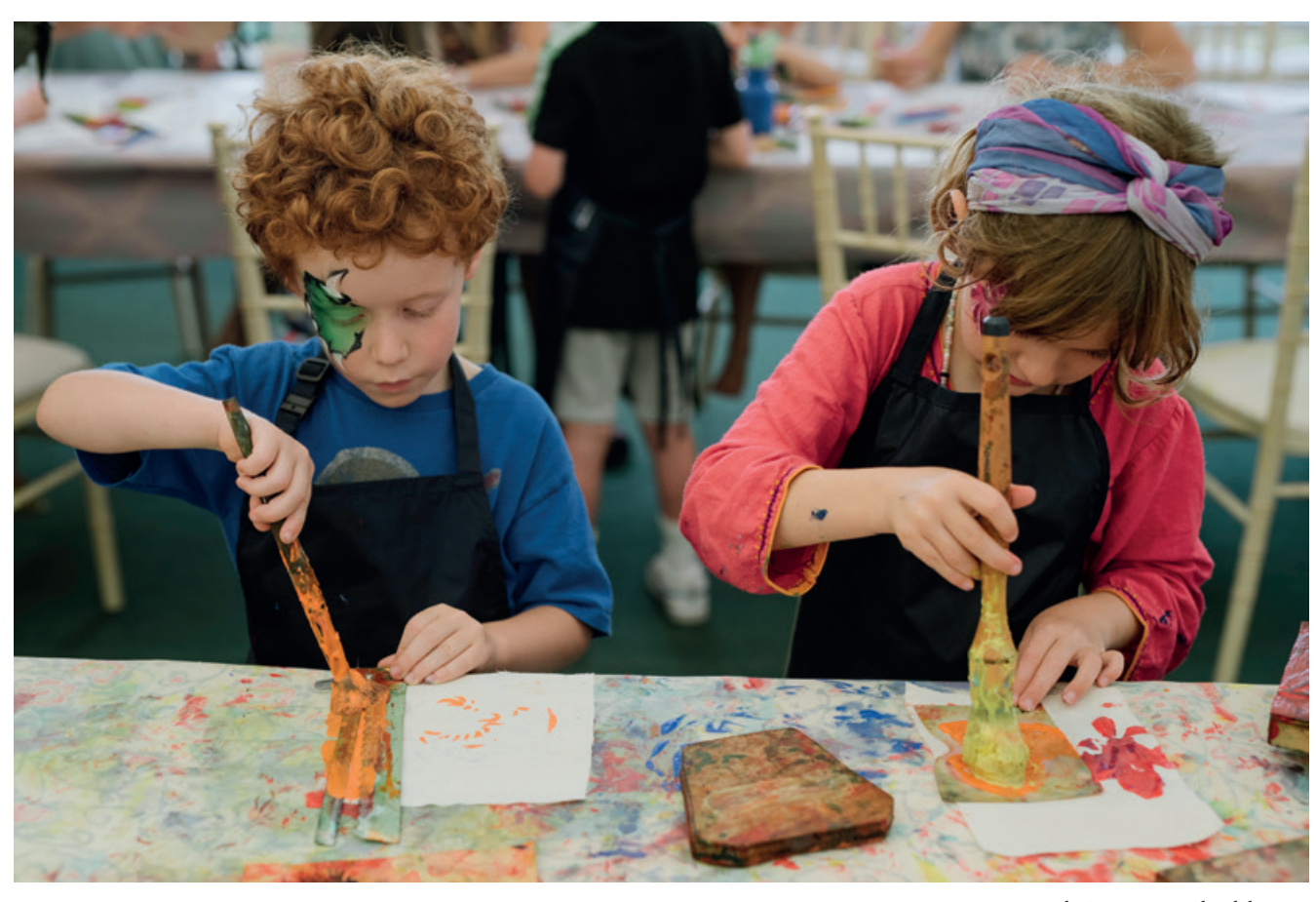
Family Open Day at Glyndebourne

With thanks to the generous individuals, Trusts & Foundations and organisations that have shown support to Glyndebourne and who help ensure we can continue to be a special place where world-class opera is created and enjoyed.