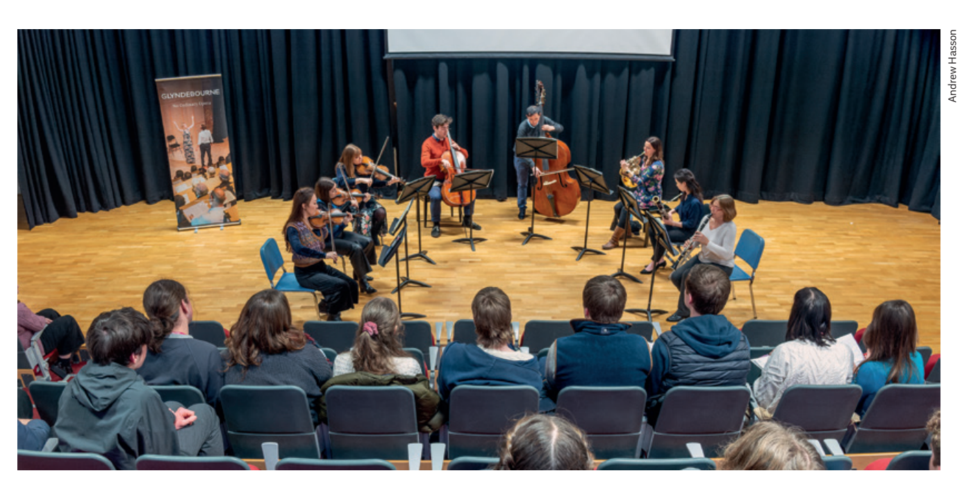
Chamber music recital