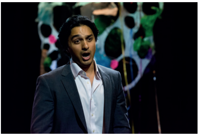
Pegasus Opera concert (RESEO Conference)