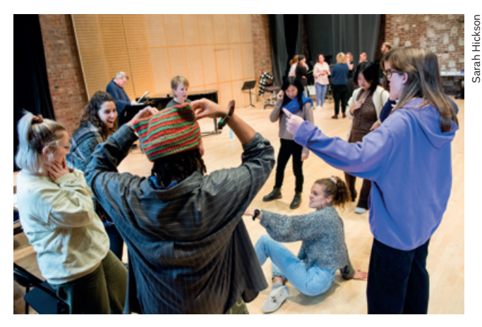
PGCE workshop at Glyndebourne

We co-hosted a European conference in November 'Potential Unlocked: Inclusive and Holistic Talent Development in the 21st Century' with partners RESEO (the European network for opera music and dance education of which we were a founder member), Create Music (the music hub for Brighton & Hove and Sussex), and South East Dance. Delegates attended Glyndebourne's Talent Showcase Concert as part of a conference package. Glyndebourne partners Pegasus Opera presented a concert as part of the conference programme on Saturday 18 November.