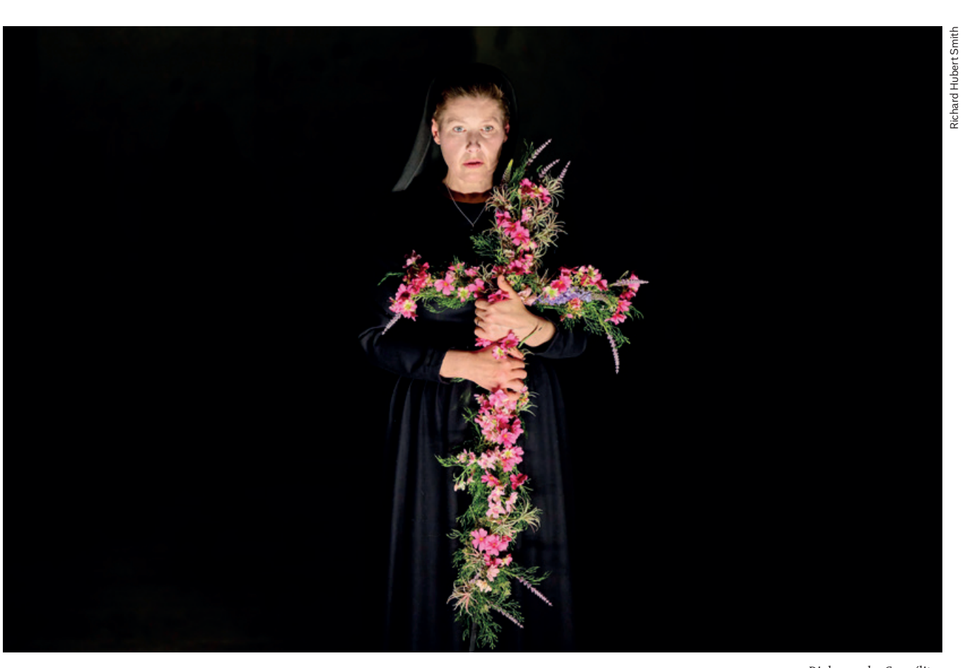
Dialogues des Carmélites

Dialogues des Carmélites review in The Times