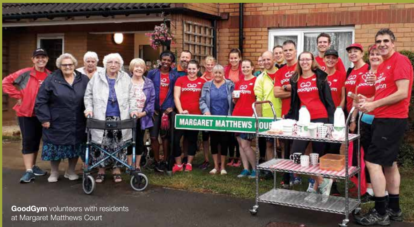
GoodGym volunteers with residents at Margaret Matthews Court