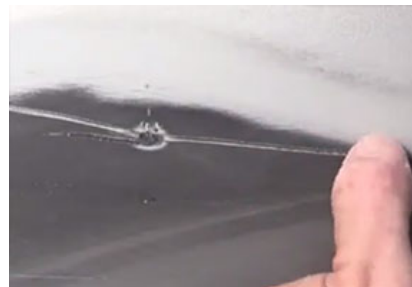
Deeper scratches, longer than 50mm in diameter should be specifically noted in the report and / or photographs.

If any such damage is not noted on the Equipment Condition Report or condition photographs -you should inform us immediately.