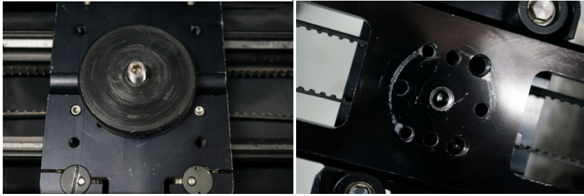
General marks on sliders are considered acceptable (as long as they are no deeper than 2mm) and do not need notation or reporting to Hirecamera.

These are large and therefore quite exposed items and are vulnerable to a degree of wear. We therefore consider all surface scratches (up to a depth of 2mm) on the bodywork as acceptable wear. However, in order to ensure they are able to move smoothly (as intended), the rails should be free of any dents / kinks in the metal - which could lead to movement issues.