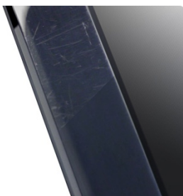
Small areas of scratches, smooth and less than 50mm in diameter - no need for specific notation.

A certain amount of marks and scratches on the plastic bodywork on these devices is inevitable and any situations where a blemish has no depth and is less than 50mm diameter, we would consider this to be acceptable and would not need to be specifically mentioned on the Equipment Condition Report: