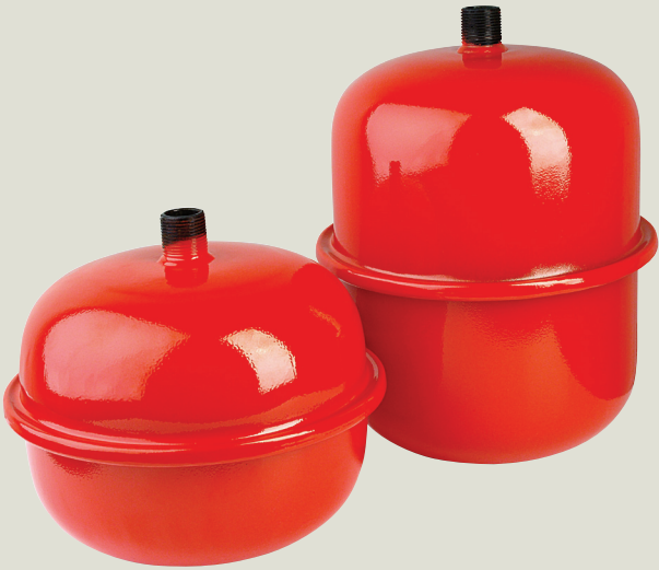
calpro range of expansion vessels for central heating applications