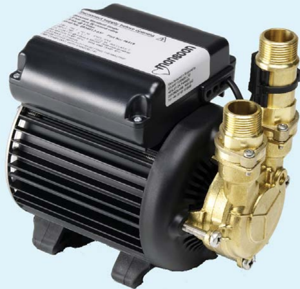
Monsoon Standard Single Pumps