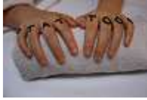
Position C: showing fingers draped over a rolled towel