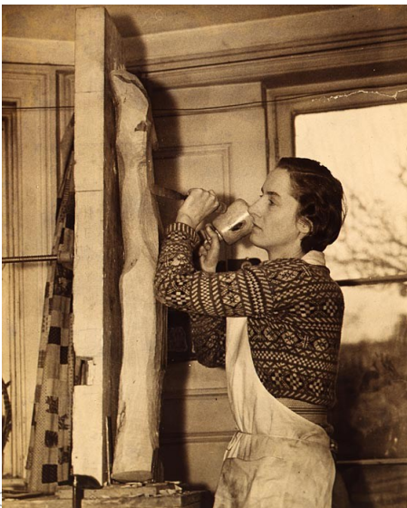
Gertrude Hermes, Carving, (Planet New, silver gelatin print), archive imagery

THE FIRST UK RETROSPECTIVE FOR 30 YEARS WILL FEATURE OVER 120 WORKS TO OFFER A FRESH PERSPECTIVE ON THE WORK OF THIS ACCLAIMED BRITISH ARTIST AND CONTEMPORARY OF BARBARA HEPWORTH AND HENRY MOORE