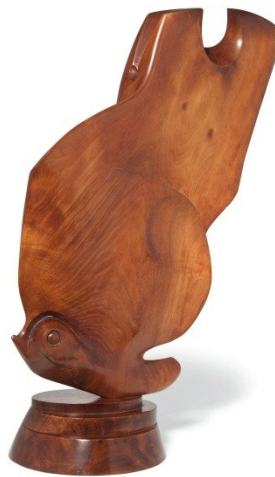
Gertrude Hermes, Butterfly , 1937, walnut, 74 x 58 x 9 cm. Image © Christie's Images Limited (2015). Courtesy private collection - Collection of Ömer M. Koç © The Gertrude Hermes Estate.