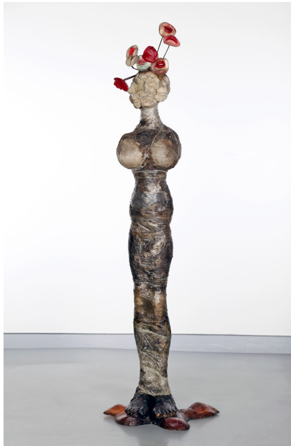
Alina Szapocznikow Bouquet II, 1966 Plaster, plastic foil, coloured polyester resin, metal. Courtesy Muzeum Sztuki, Łódź. © ADAGP, Paris 2017. Courtesy The Estate of Alina Szapocznikow / Piotr Stanislawski / Galerie Loevenbruck, Paris.