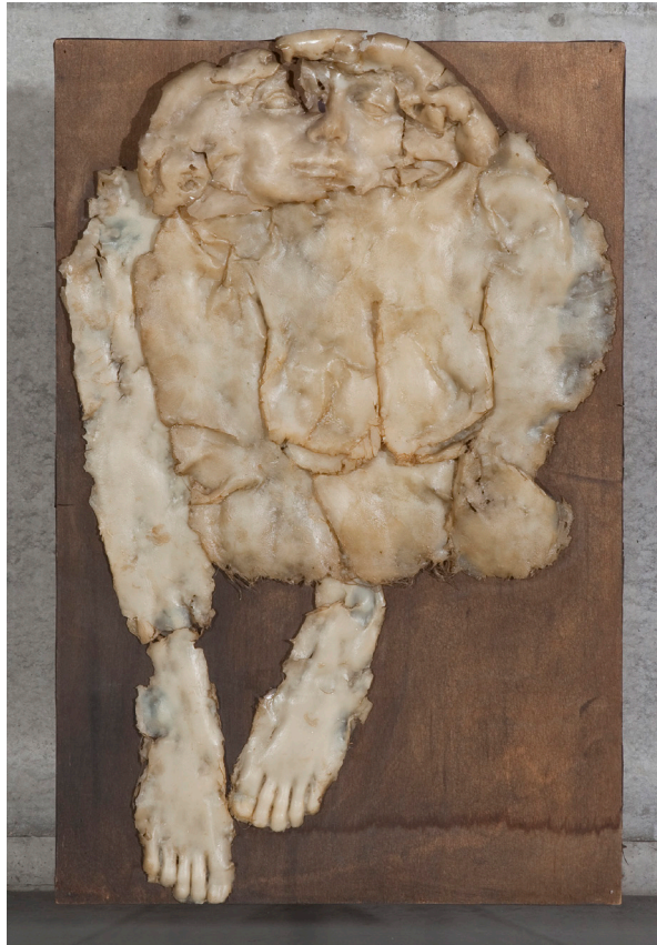
Alina Szapocznikow, Self-portrait - Herbarium , 1971 Polyester and polychrome wood Grażyna Kulczyk Collection. Courtesy The Estate of Alina Szapocznikow / Piotr Stanislawski / Galerie Loevenbruck, Paris. Photograph Bartek Buśko.