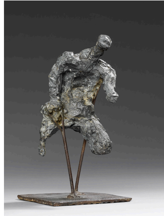
Alina Szapocznikow Monstrum II [Monster II] , 1957 Lead and metal construction © ADAGP, Paris 2017. Courtesy The Estate of Alina Szapocznikow / Piotr Stanislawski / Galerie Loevenbruck, Paris. Photo Fabrice Gousset.