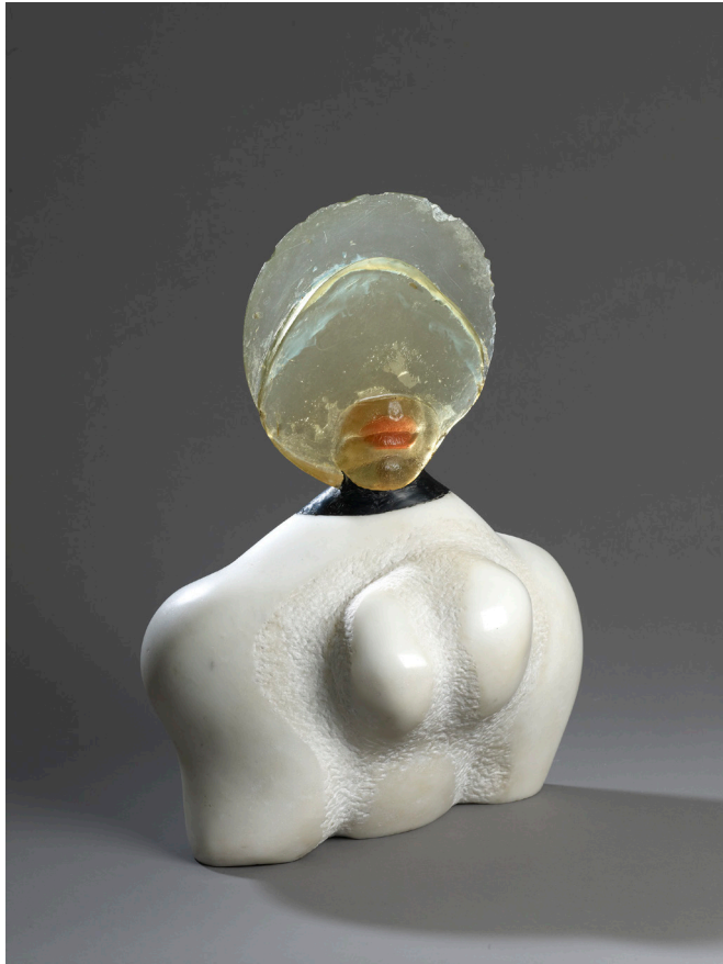
Alina Szapocznikow Autoportrait I , 1966 Marble, polyester resin Private collection © ADAGP, Paris 2017. Courtesy The Estate of Alina Szapocznikow / Piotr Stanislawski / Galerie Loevenbruck, Paris. Photo Fabrice Gousset.