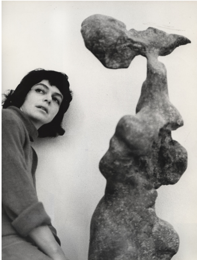
The artist with her work Naga [Naked] , 1961 © ADAGP, Paris 2017 The Alina Szapocznikow Archive / Piotr Stanislawski / National Museum in Krakow Photograph Marek Holzman, courtesy the Museum of Modern Art, Warsaw.