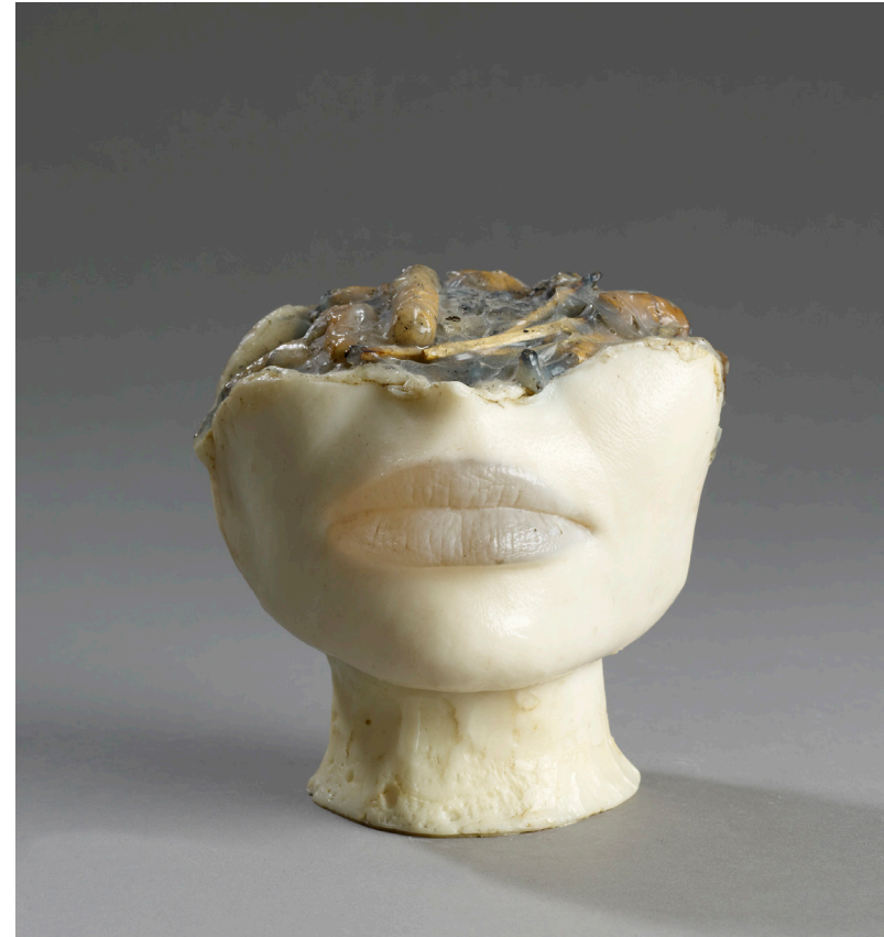
Alina Szapocznikow Cendrier de Célibataire I [ The Bachelor's Ashtray I ], 1972 Coloured polyester resin and cigarette butts Private collection