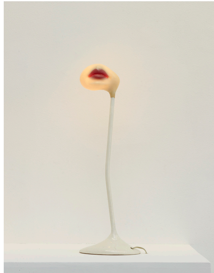
Alina Szapocznikow Lampe-Bouche [Illuminated Lips] , 1966 Coloured polyester resin, electrical wiring and metal © ADAGP, Paris 2017. Courtesy The Estate of Alina Szapocznikow / Piotr Stanislawski / Galerie Loevenbruck, Paris. Photo Fabrice Gousset.