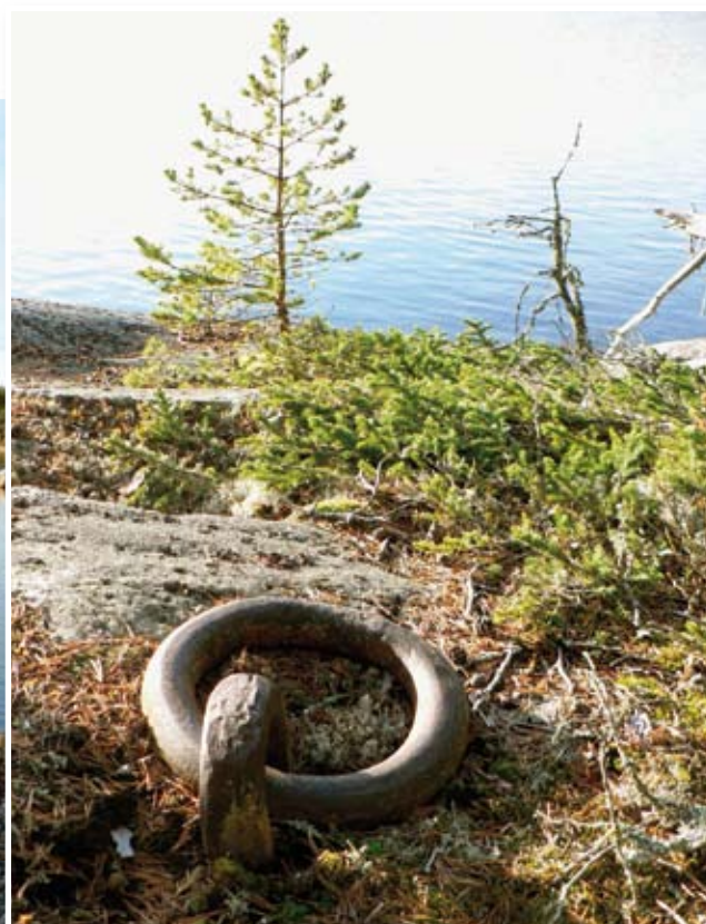
Ballast harbour at Holmhällan nature reserve