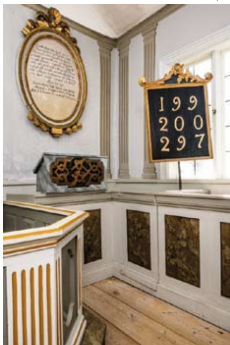
The reading bench and hymn number board in Agö chapel.

The fishing chapels have been well taken care of by the users, who wanted to keep them as they always looked. But the chapels are in the highest degree a living cultural heritage still used and yearly visited by lots of people. They are well liked tourist destinations during summer time and still used for divine service, baptism and weddings.