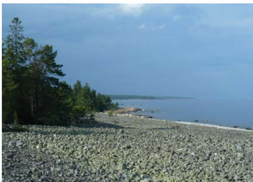
Cobblestone fields in Vattingsmalarna nature reserve.

The largest cobblestone field in the county stretches 500 metres in from the sea in the nature reserve of Vattingsmalarna. Old shores have built terraces in the field, forming very long lines. Nowhere along the coast of Gävleborg can you see so longish and clearly marked terraces as here. They are lying there as the sea left them when the water quickly sank to a lower level and the waves started to form a new line of rounded stones. The vegetation in the cobblestone fields is mostly meagre and consists of heather, blueberries, cowberries, bearberries and bog whortleberries.