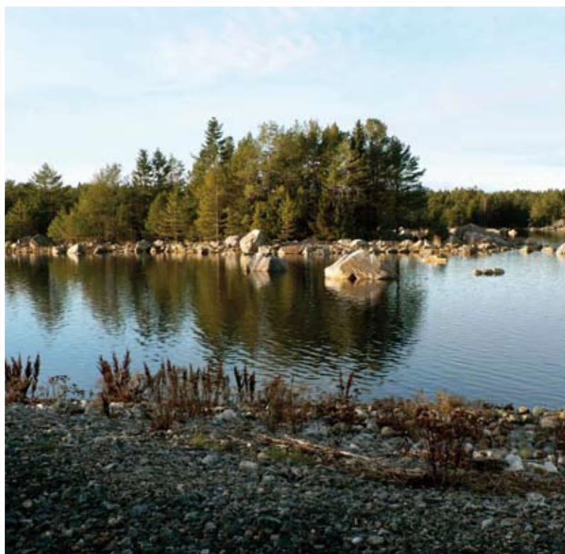
View of natural reserve Notholmens.

At Holmhällan, on the west side of the island, there are traces from