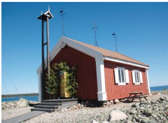
The fishing chapel in Kuggörarna.