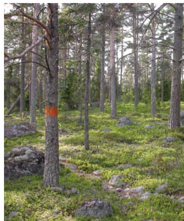
Stroll along The coastal trail through Klacksudden nature reserve.

The woods of Klackudden are clearly characterized by the nearness of the sea. Along the rocky slopes open forests are dominating. In the more fertile parts there are fir forests with deciduous. Many traces show that the land has been inhabited by men for a long time. The most ancient remains consist of memorial mounds of stones from the Bronze Age or early Iron Age. Not so old are the traces of buildings near Gamla hamnen (The old harbour).