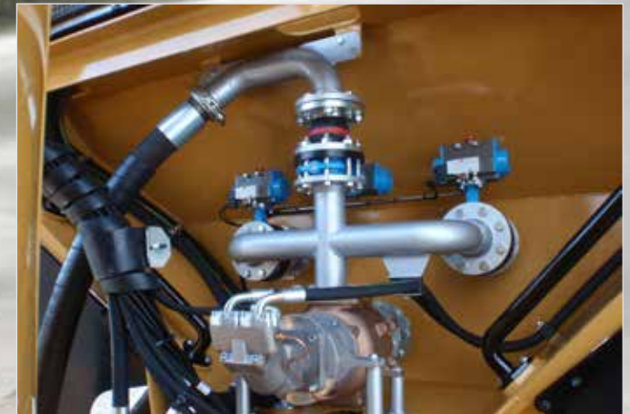
3000L/minute water pump and valves