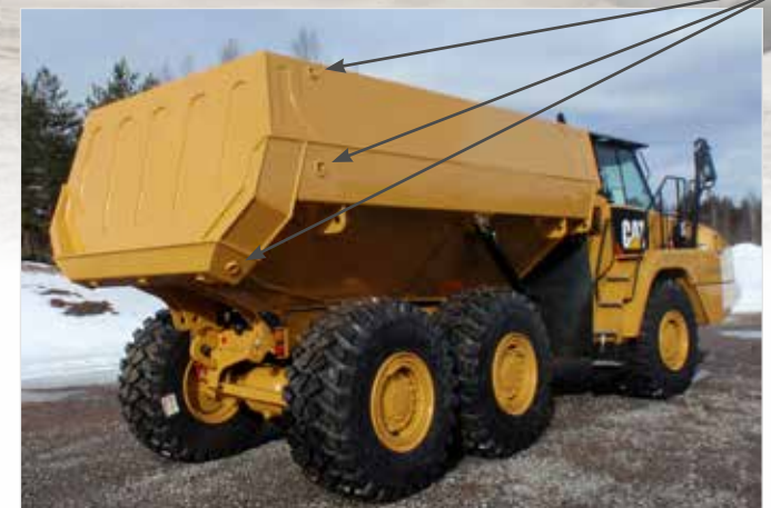
Rear sprinkler nozzles for 360° spread intergraded in tank. Tank reinforced for underground use.