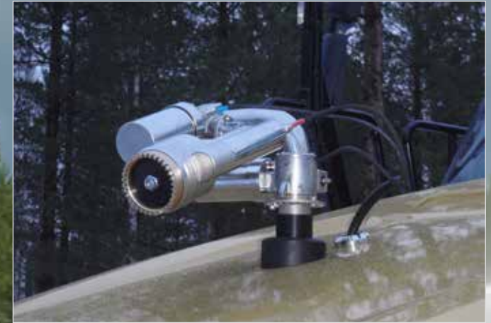
Stainless steel front water cannon intergraded in hood

Lonestar Water Dump Trucks are built on customer supplied new or used CAT and Volvo chassies. All Water Dump Truck conversions are CE certified.