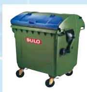
4-wheeled container systems