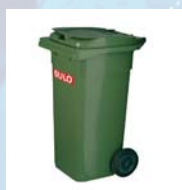
2-wheeled container systems

Our complete product range comprises plastic and steel refuse containers as well as underground systems, city furniture and innovative weighing and identification systems for all aspects of collection logistics.