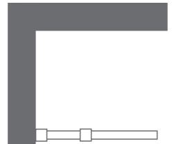
Twin Panel Bathscreen