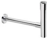
1 1/4" outlet connector for basin. 300 Pipe