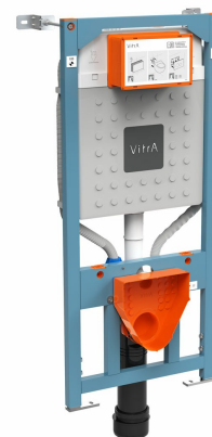
Product Code: 762-5805-01