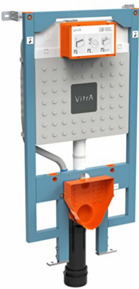
Product code: 768-5800-01