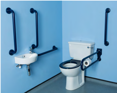
Doc.M value pack plus blue grab rails and seat. Right hand installation shown.

thermostatically protected via external blending valve