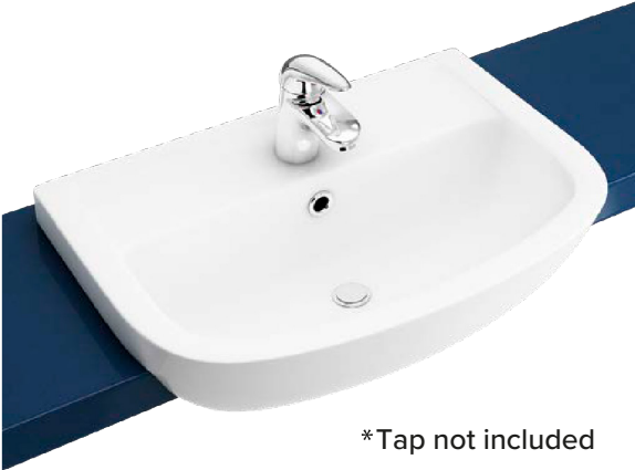
*Tap not included