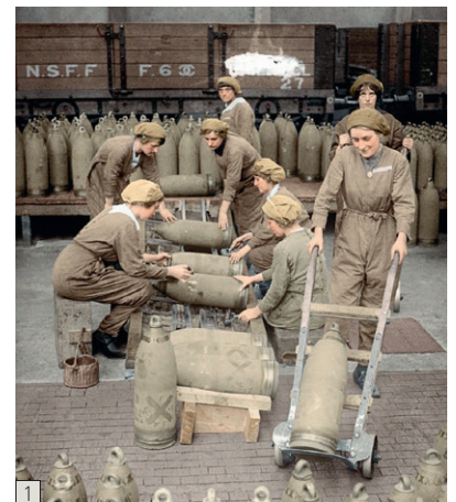
1. Women working in a munitions factory making shells.

In September 1918 British artillery began dropping shells on the Hindenburg Line, a series of German trenches believed to be impenetrable, while tanks and infantry attacked on the ground. By October the Germans were retreating along the Western Front.