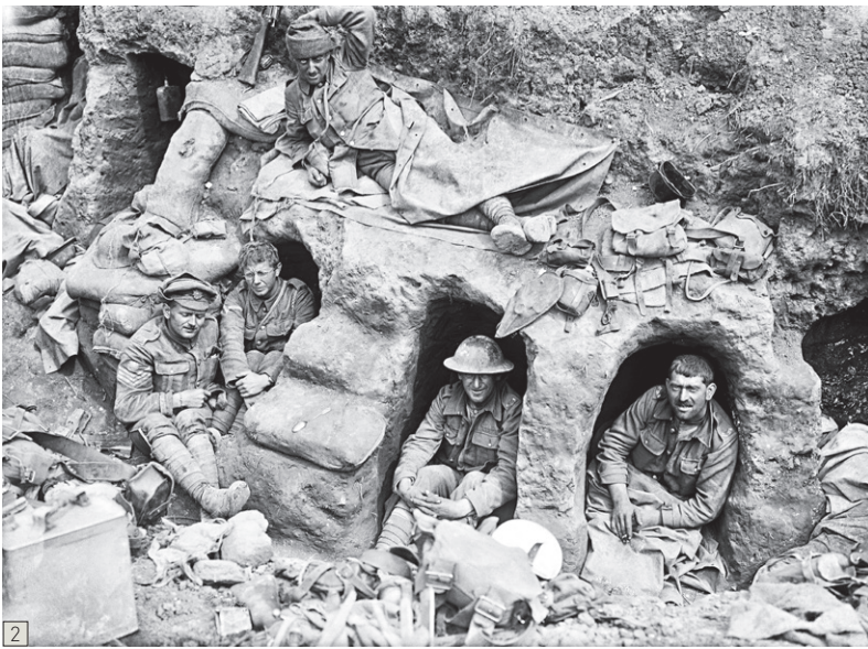
2. Soldiers resting in shallow trenches during the Battle of the Somme in 1916.