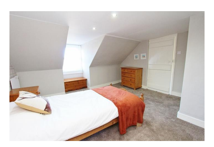
BEDROOM 7: A further bedroom to the side with electric panel heater.