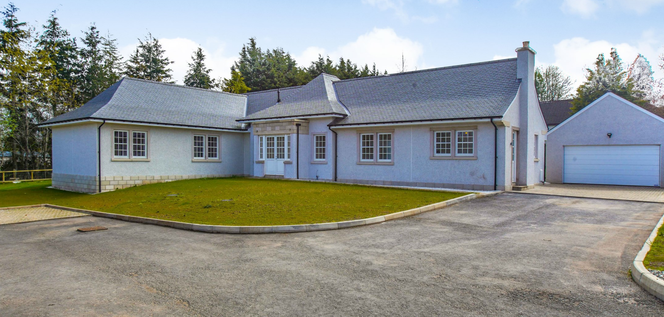
ROWAN, CASTLETON GARDENS CASTLETON ROAD, AUCHTERARDER, PH3 1AG