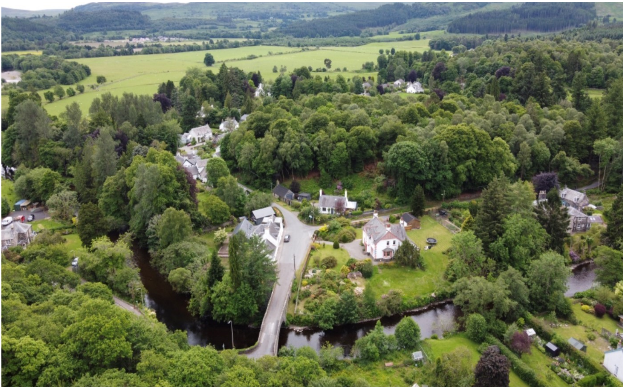
THE ROSS, COMRIE