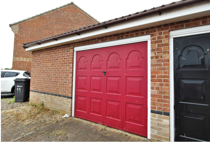
Large Garage with parking in front