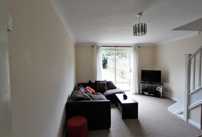
Lounge / Diner with stairs rising to first floor