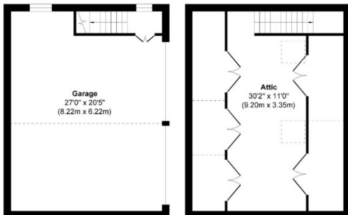
Garage Ground Floor

These particulars are believed to be correct, but their accuracy is not guaranteed and they do not form part of any contract. All measurements shown are approximate only.