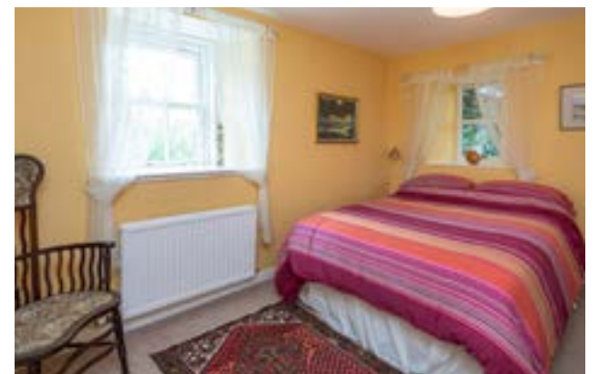
Master bedroom with built in storage and ensuite