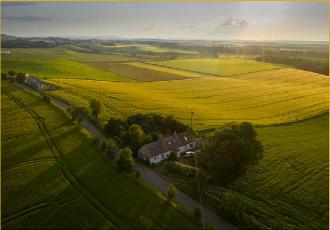
The Smiddy, Longyester

Those wishing to be kept informed of a closing date should advise the selling agents. The statements, measurements and diagrams contained in these particulars are offered for guidance only and prospective purchasers are advised to satisfy themselves by inspection or otherwise as to their correctness. The agent has not tested any apparatus, equipment, fixtures and fittings or services and so cannot verify that they are in working condition or fit for purpose. A prospective purchaser is advised to obtain verification from the solicitor or surveyor.