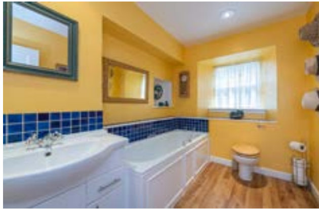
Bright and traditional