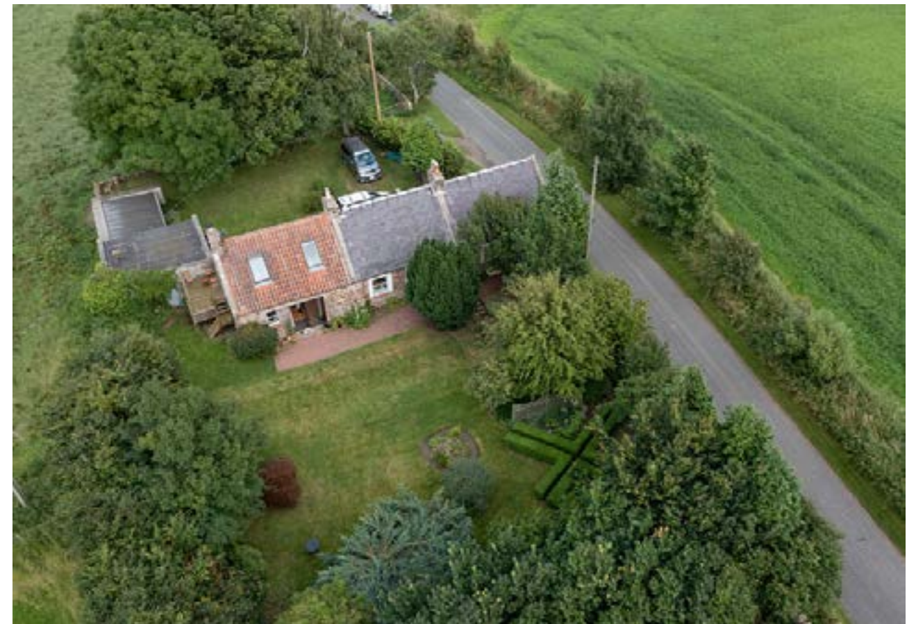
A view of the house from above

Recently installed, the en-suite is easy to keep, being tiled floor to ceiling.