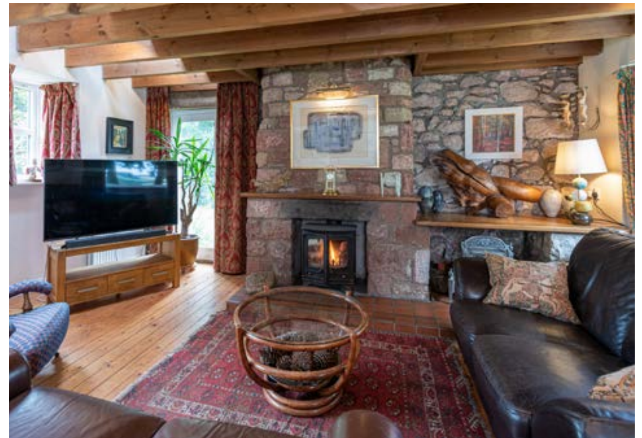
Lounge with multi-fuel stove, and sliding doors out to garden - cosy and bright simultaneously