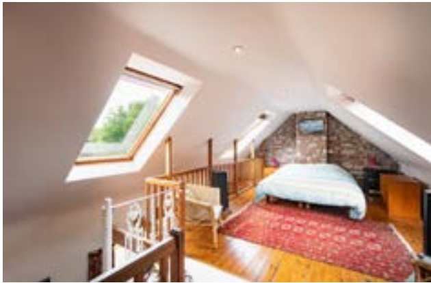
Open mezzanine space; currently used as a bedroom