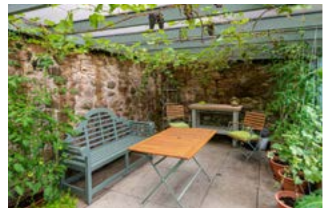
Sunroom with grapevines and tomatoes bearing fruit