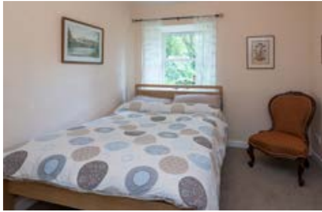
Downstairs guest room; bedroom 2