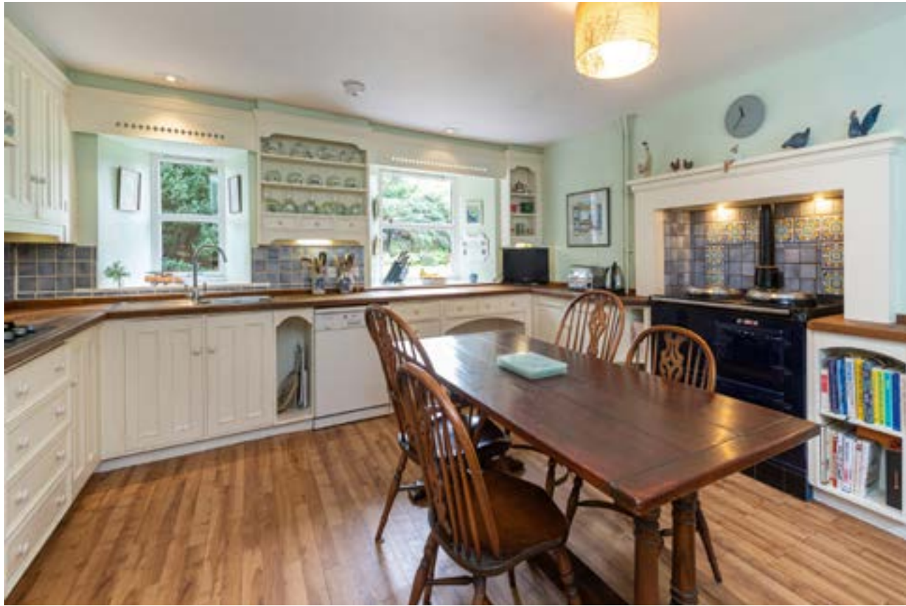
The heart of the home; the kitchen