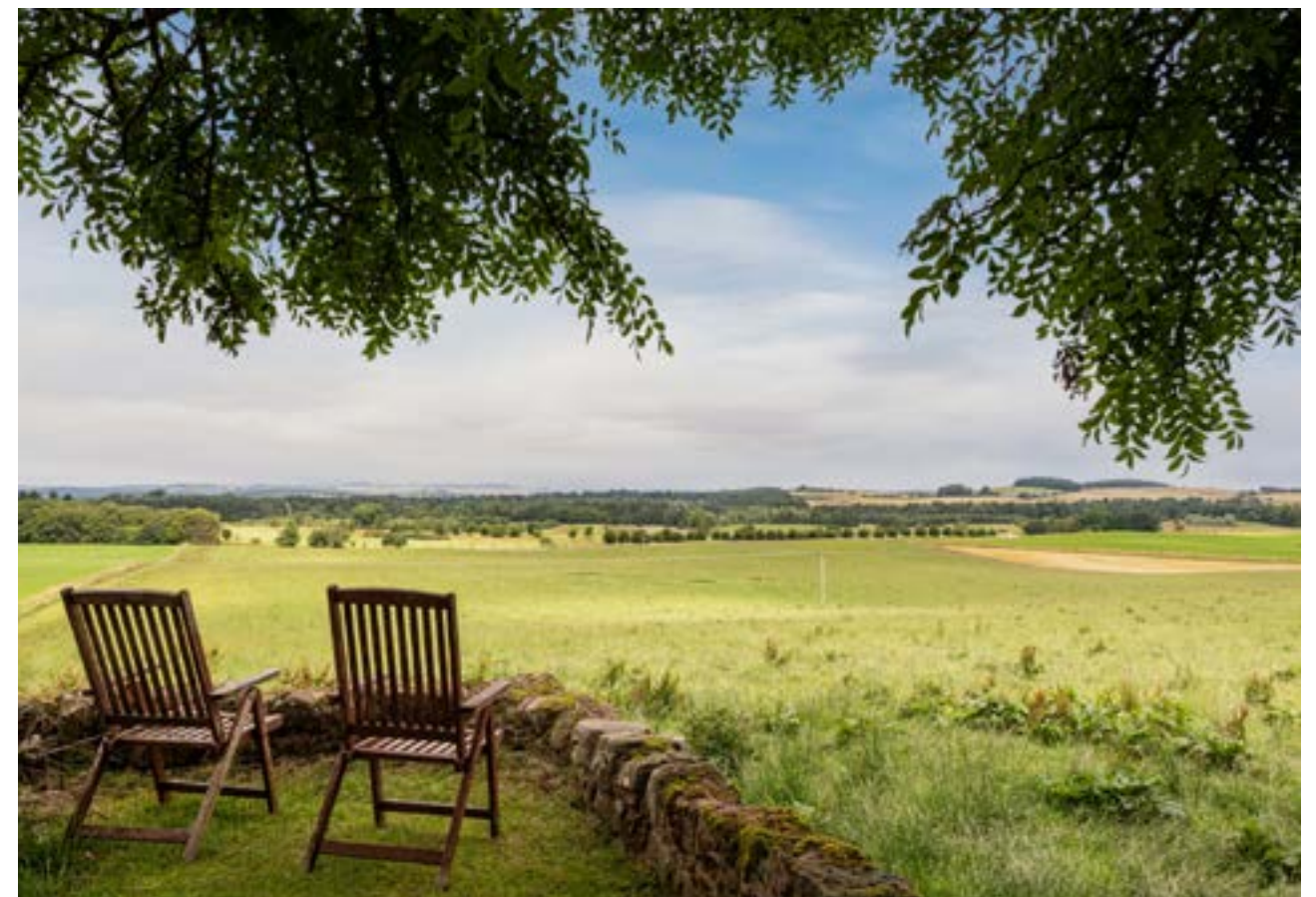
Incredible views over East Lothian, to Fife and beyond