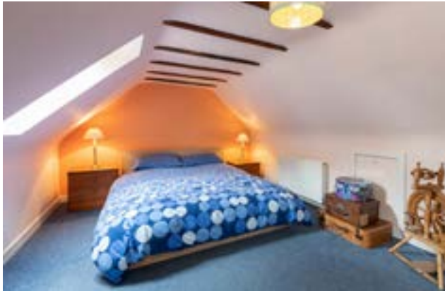
In the eaves; bedroom 3