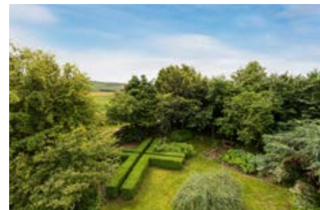
Impressive established gardens at the rear