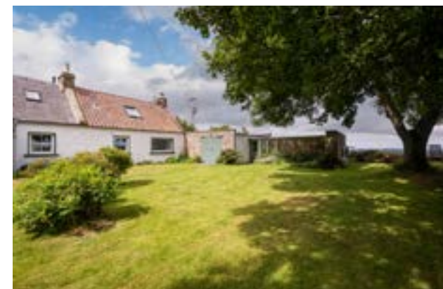
Extensive gardens to the front of the house