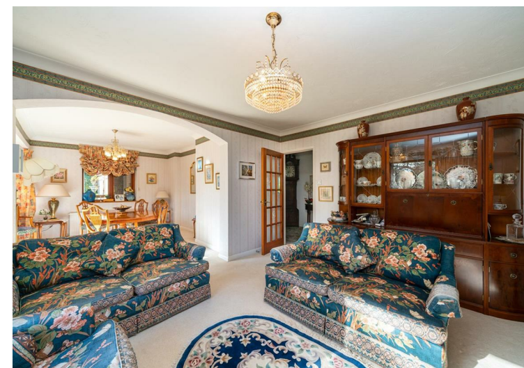
Bulstrode Lane Felden