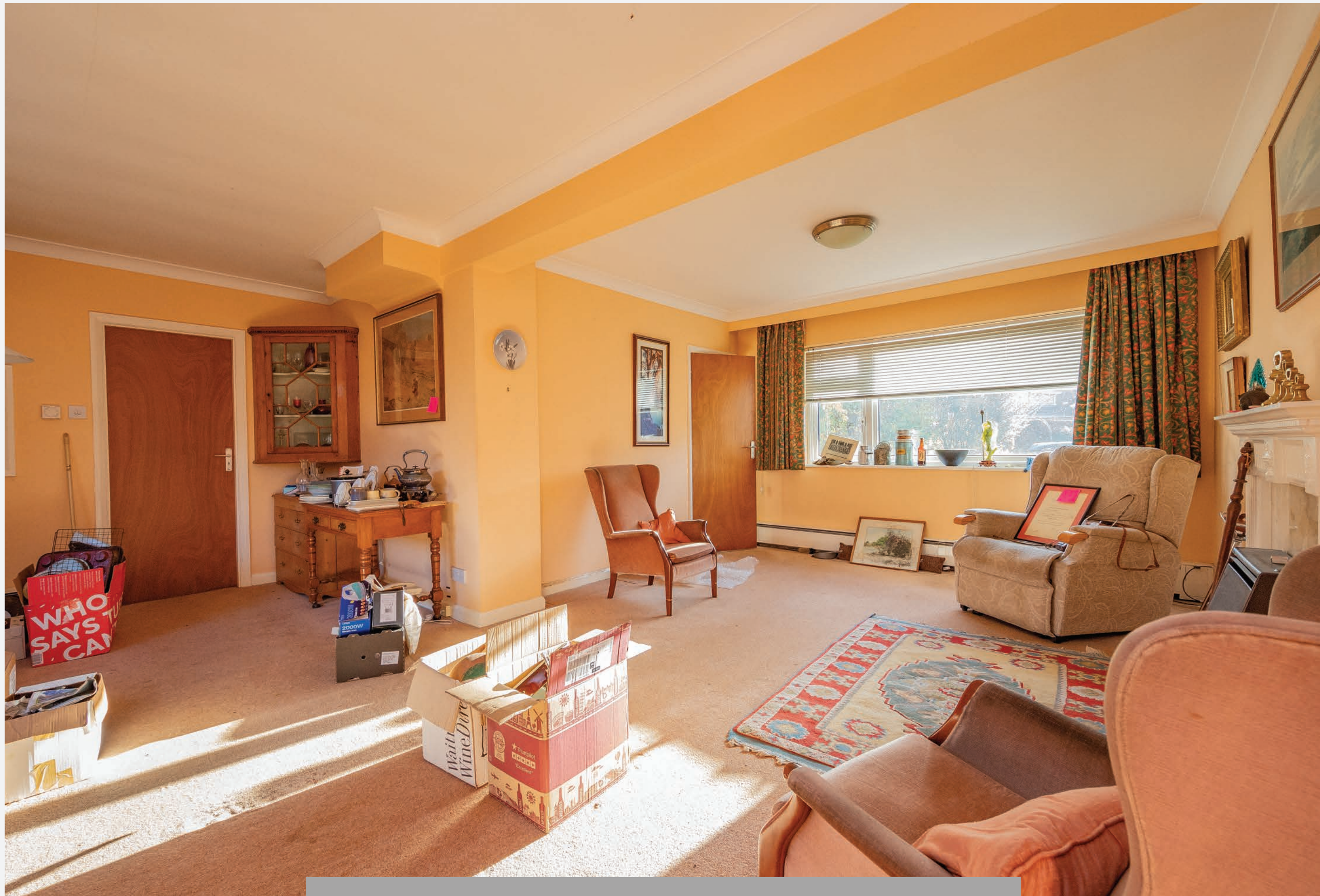
Detached home within walking distance of Corbridge centre with a surrounding plot, garaging and driveway parking.