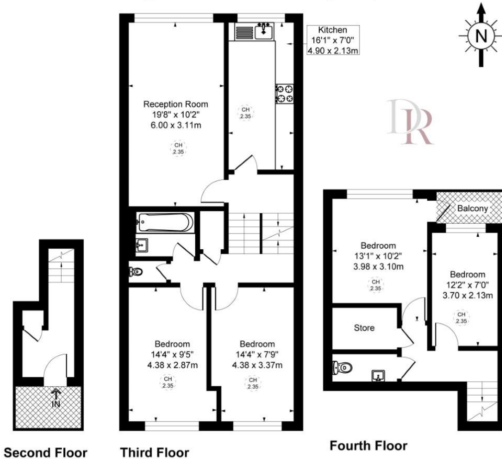
Illustration for identification purposes only, not in scale

Approximate Gross Internal Third Floor Area 755 sq ft - 70 sq m Approximate Gross Internal Fourth Floor Area 333 sq ft - 31 sq m Approximate Gross Internal Total Area 1088 sq ft - 101 sq m