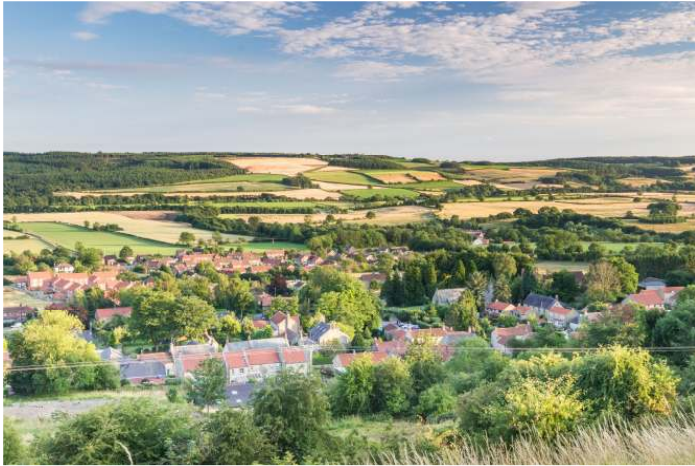
View of Ampleforth village.