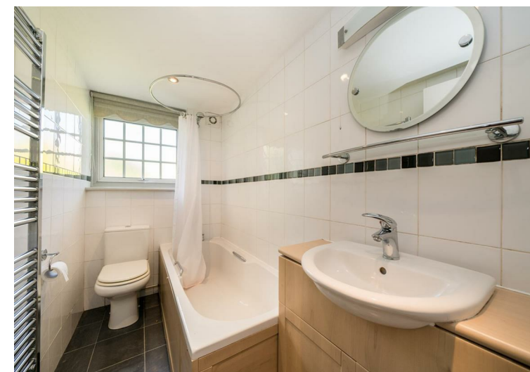
Highfield Road Berkhamsted