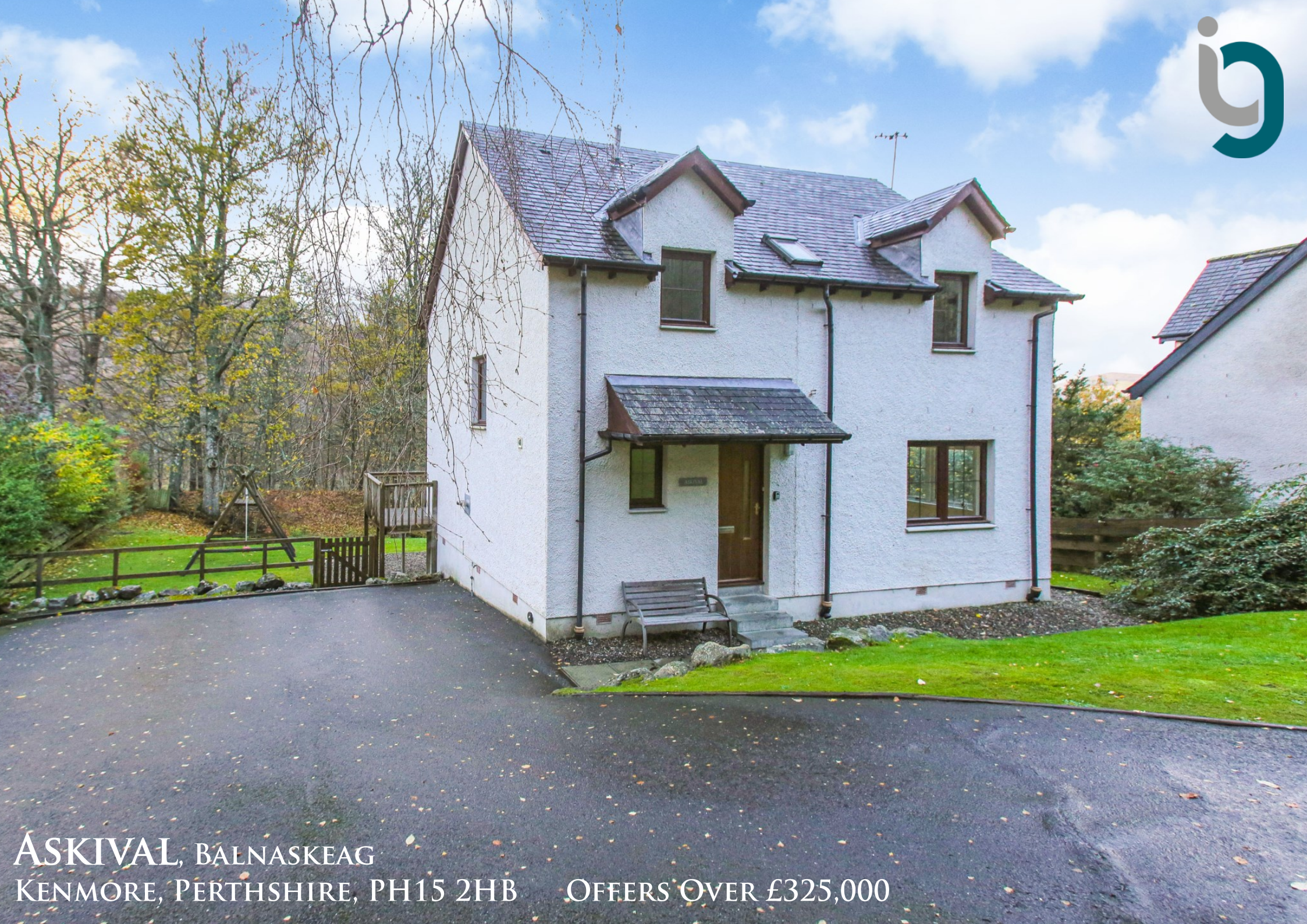
ASKIVAL, BALNASKEAG KENMORE, PERTHSHIRE, PH15 2HB OFFERS OVER £325,000