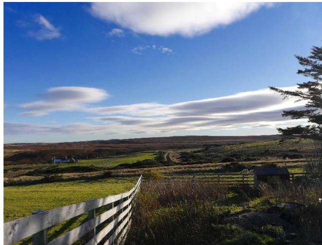
Garden / View