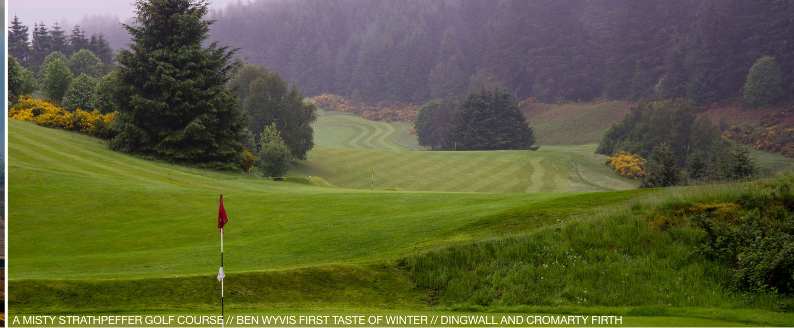
A MISTY STRATHPEFFER GOLF COURSE // BEN WYVIS FIRST TASTE OF WINTER // DINGWALL AND CROMARTY FIRTH