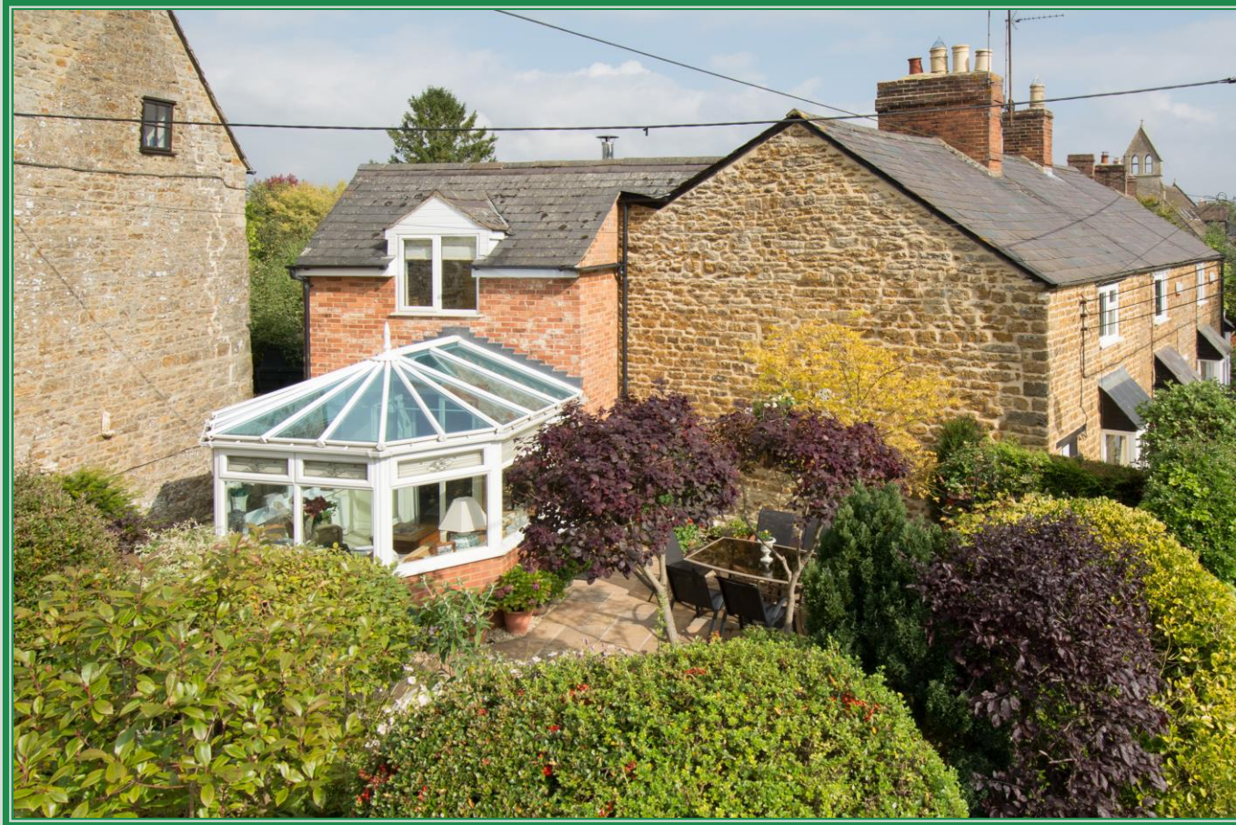
1 Victoria Terrace Clifton, Banbury, Oxfordshire, OX15 0PD