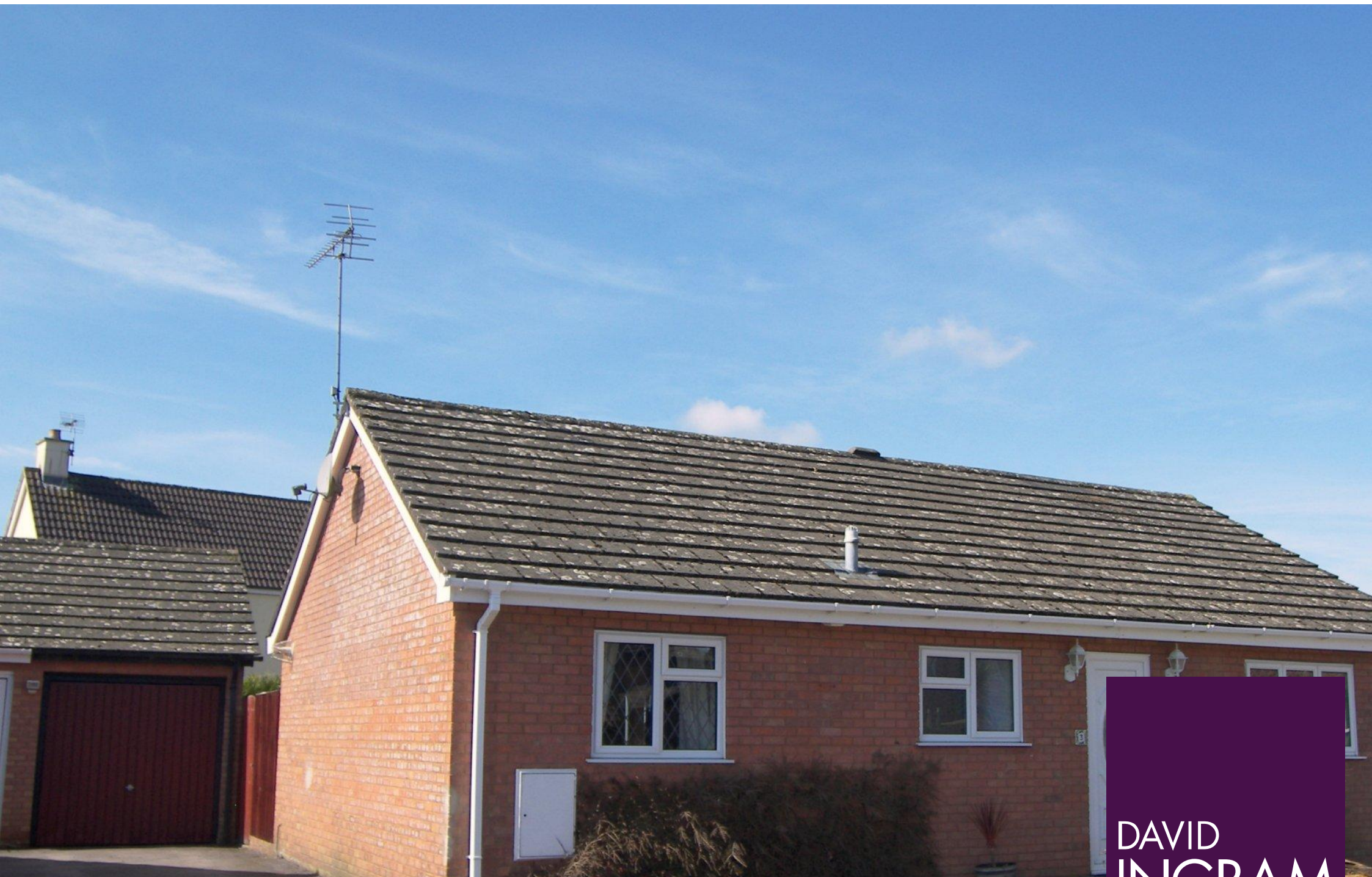
3 Tasker Close, Corsham, Wiltshire, SN13 9UF