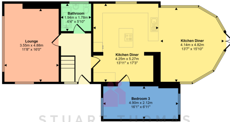
Ground Floor Approx 82 sq m / 882 sq ft

Approx Gross Internal Area 123 sq m / 1321 sq ft