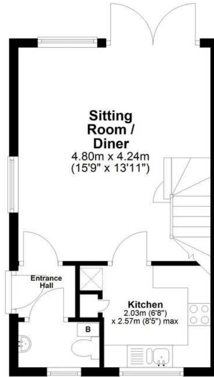
Ground Floor Approx. 30.4 sq. metres (327.7 sq. feet)