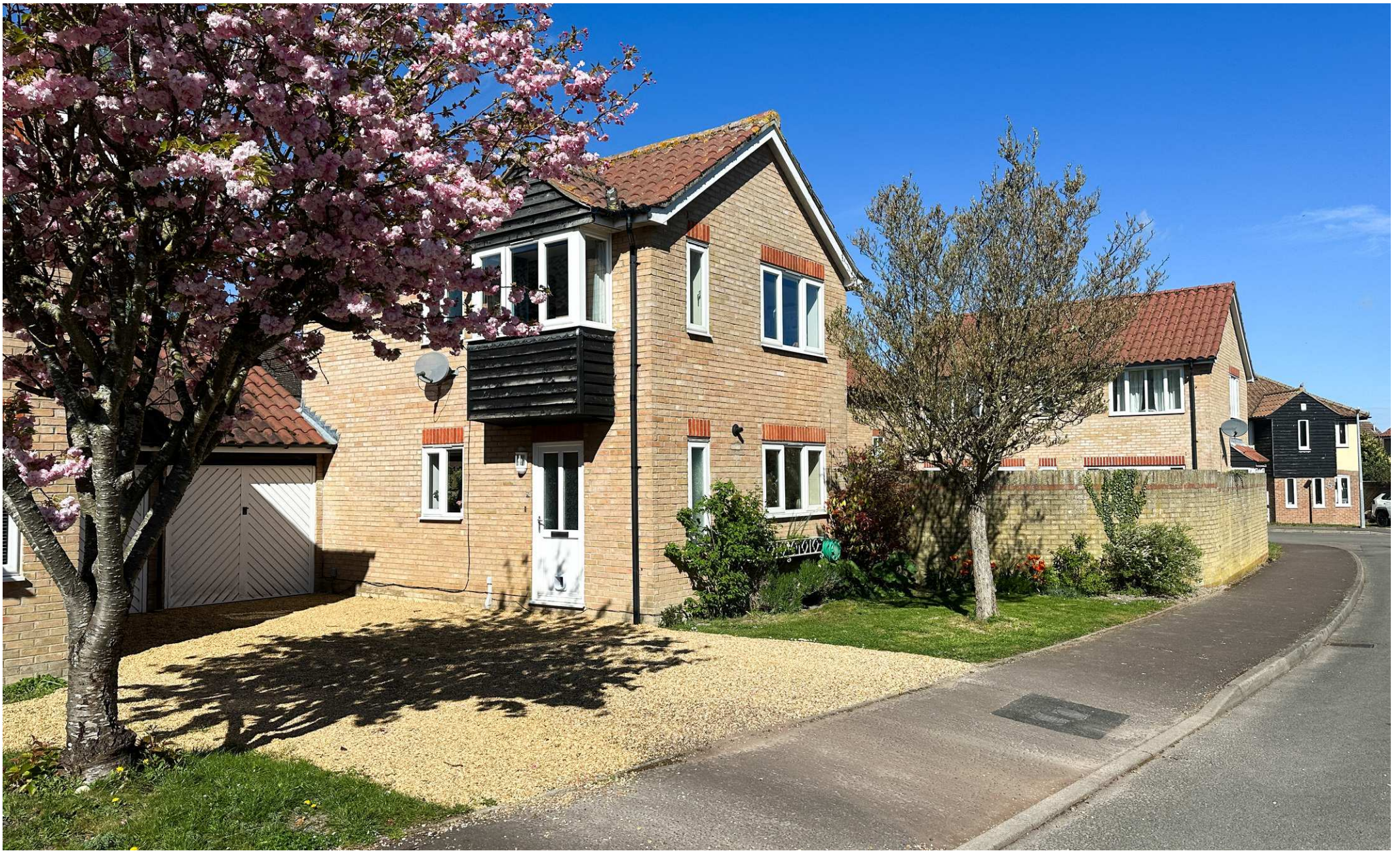
Melford Close, Burwell