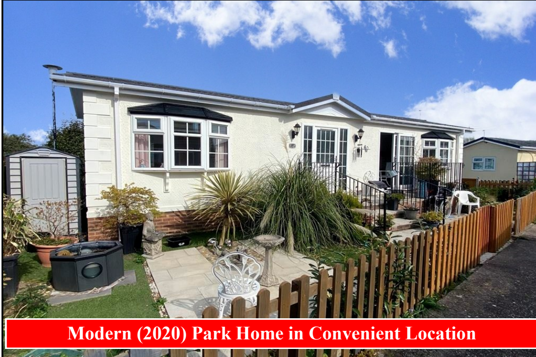
Modern (2020) Park Home in Convenient Location

33 Iford Bridge Park, Iford, Bournemouth. BH6 5RQ