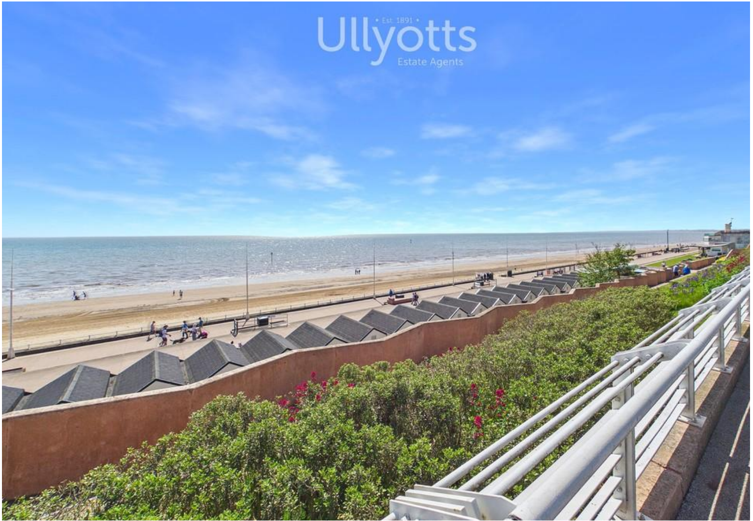
View From Front