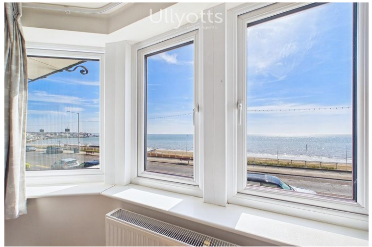
View From Bedroom 1