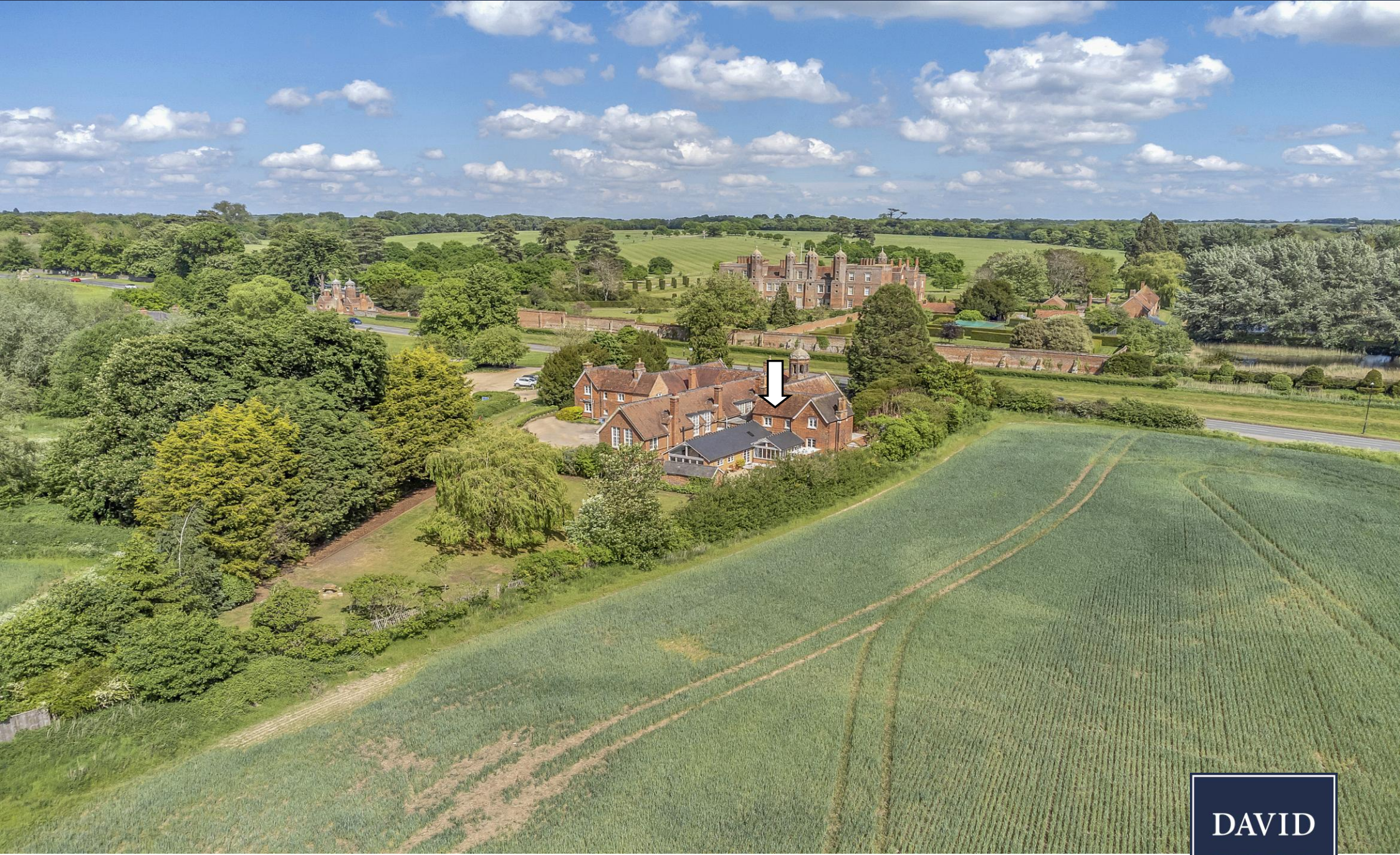
South School House, The Green, Long Melford, Suffolk.