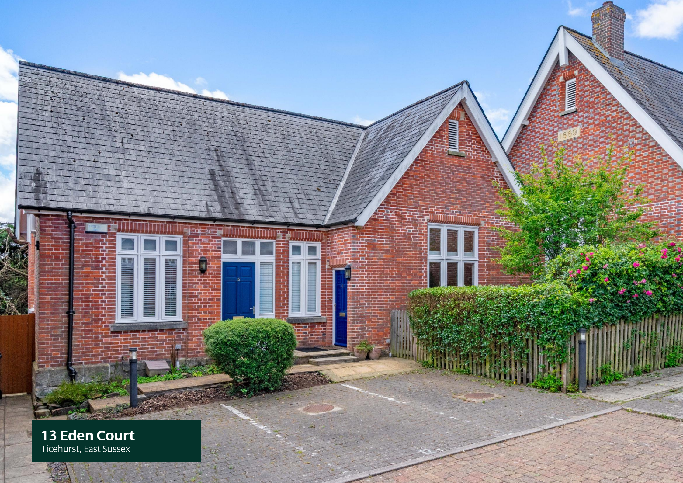
13 Eden Court Ticehurst, East Sussex