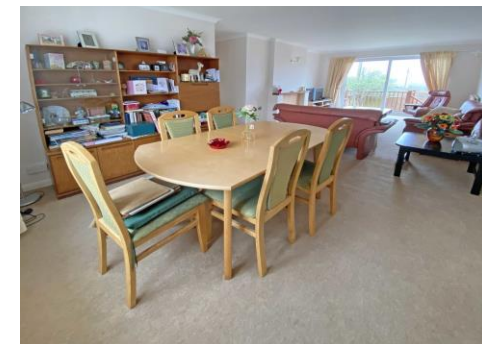
EPC TO FOLLOW

Measurements are approximate. Not to scale. Illustrative purposes only. Made with Metropix ©2023